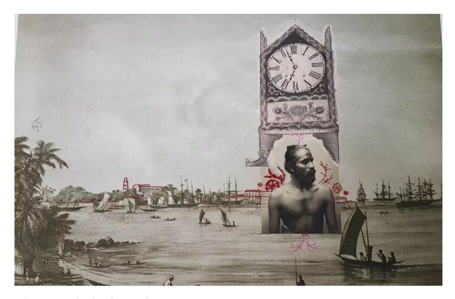
Sujeewa Kumari (Sri Lanka), Landscape , 2018.

The people who gathered at Galle Face Green Park and other areas in Sri Lanka rioted because the economic situation on the island had become intolerable. The situation was so bad that, in March 2022, the government had to cancel school examinations owing to the lack of paper. Prices surged , with rice, a major staple, skyrocketing from 80 Sri Lankan rupees (LKR) to 500 LKR, a result of production difficulties due to electricity, fuel, and fertiliser shortages. Most of the country (except the free trade zones ) experienced blackouts for at least half of each day.