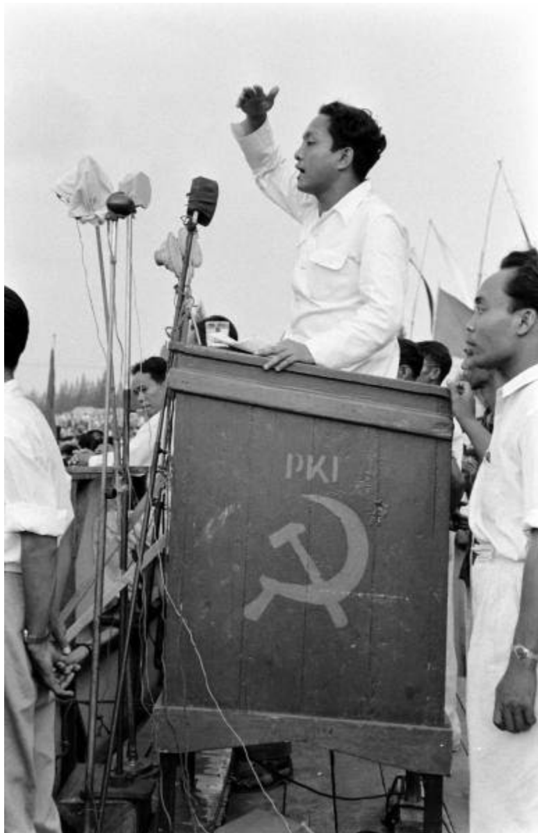
Indonesia elections, Howard Sochurek, 1955.

Democracy Without Democracy. In societies where there is no democracy, this problem is not immediate. In such places, the immediate task is to win the fullest democracy. In those societies where democracy is the main form, or where there is at least an illusion of democracy, the oligarchy and imperialism have used many methods to undermine democracy, to dominate society without suspending democracy. The methods used are sophisticated, including to delegitimise the institutions of the state, to disparage elections, to use money to corrupt the electoral process, to use social media and advertising to destroy opposition candidates and to utilise the least democratic institutions in a democracy – such as an unelected judiciary – to erode the power of elected officials. Can the left defend the idea of democracy from this attrition without allowing democracy to come to mean merely elections and the electoral system?