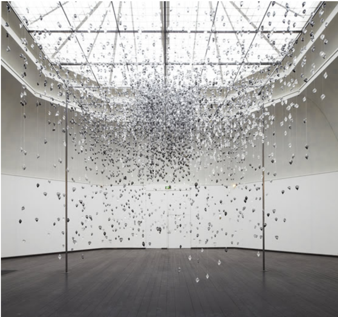
Acid Rain , Bright Ugochukwu Eke, 2009.

It is cruel to think of these hopes as naïve. It tells us a lot that it is easier to imagine the end of the earth than to imagine the end of capitalism, to imagine the polar ice cap flooding us into extinction than to imagine a world where our productive capacity enriches all of us.