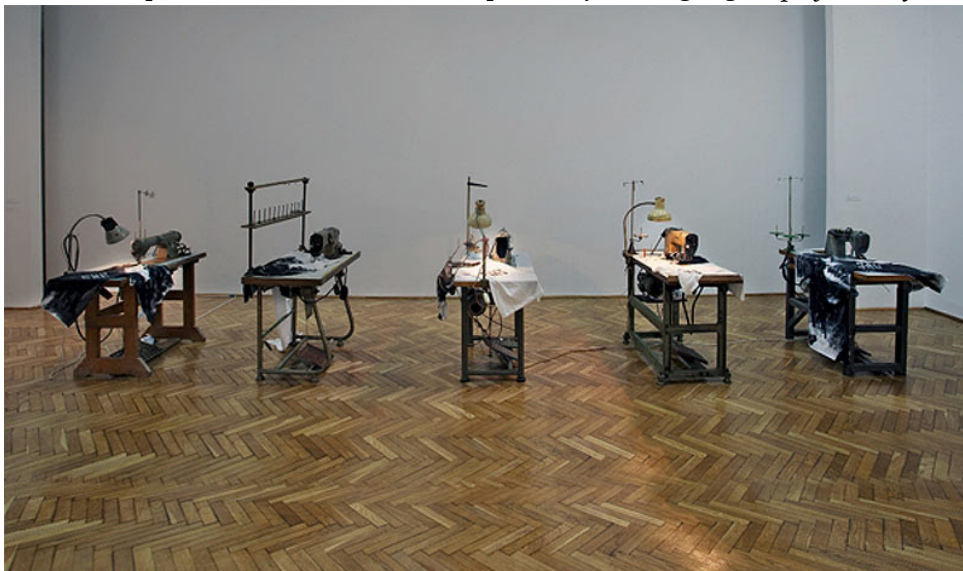
Strike , Nada Prlja, 2010.

This capital stands apart from human life, eager to accumulate more and more capital at all costs. What drives the few – the capitalists – is to increase their profits by seeking higher profitability .