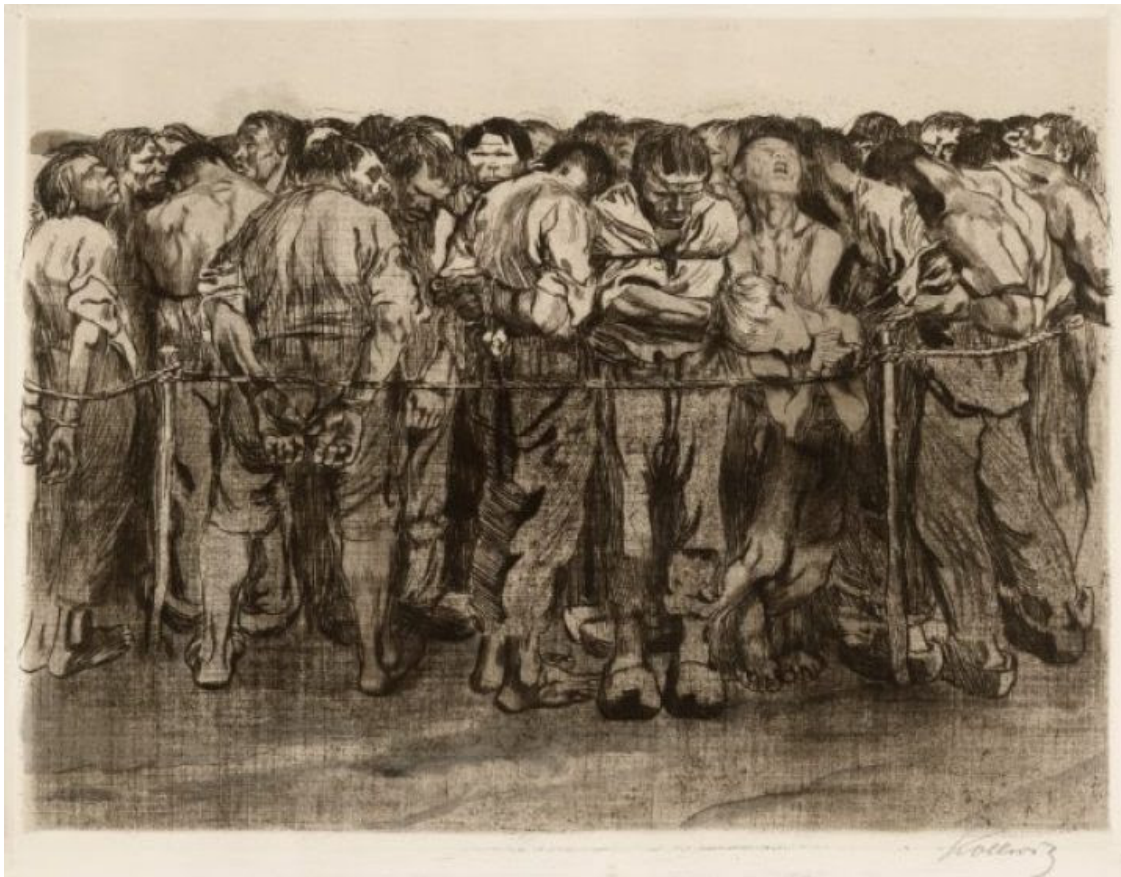
Unemployment , Käthe Kollwitz, 1909.

In 1935, the German Marxist playwright Bertolt Brecht wrote a short note on capitalism and fascism: