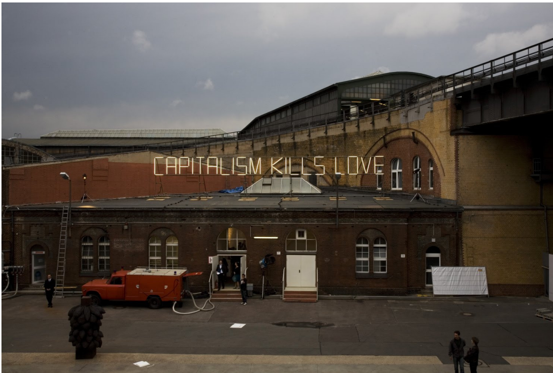
Capitalism Kills Love , Claire Fontaine, 2008.

The Strongmen enter where no such future seems possible. They belittle the mainstream politicians for their failed projects, but then they do not offer a coherent solution to the escalating crises either. Instead, the Strongmen blame the vulnerable for the dampened aspirations of the vast majority. Amongst these vulnerable are social minorities, migrants, refugees, and anyone who is socially powerless. The fangs of the Strongmen are flashed at the weak, who earn the anger of those who have high aspirations but cannot meet these aspirations. The Strongmen draw on the frustrations of people without offering any reasonable exit from a situation of high inequality and economic turbulence.