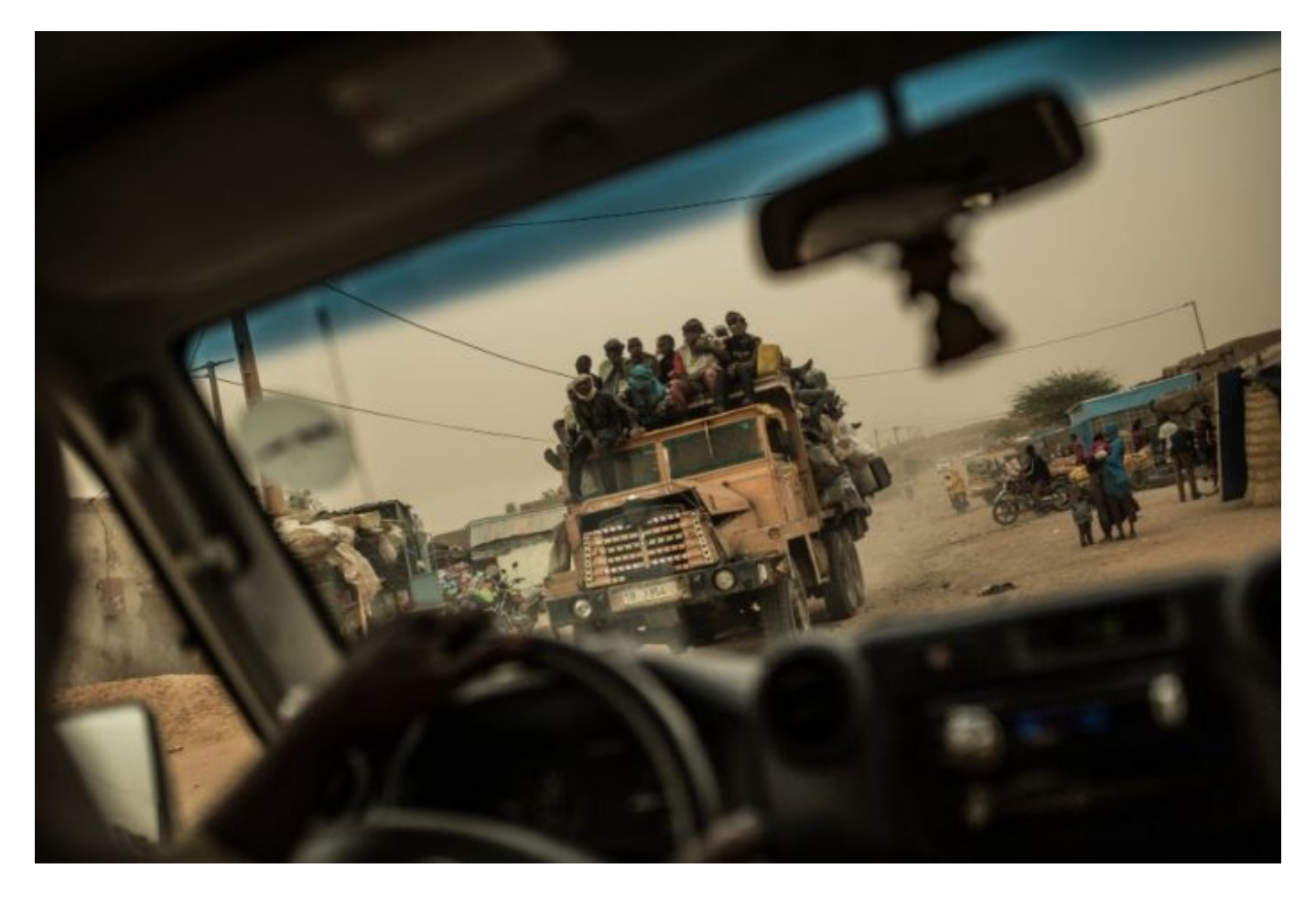
A group of migrants on the way to Libia from the city go Agadéz, Niger.

Just past us is World Refugee Day. To highlight the day, the United Nations Refugees Agency (UNHCR) has produced a great deal of documentation about the refugee crisis. It is, as you would expect, quite dramatic. There are now as many refugees as there are people in Thailand. More than half the refugees are children.