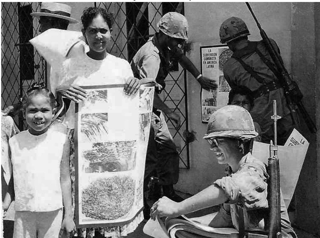
1 st US PSYWAR (Psychological War) battalion hands out anti-communist posters in Santo Domingo (Dominican Republic), 1965.

These are useful, but insufficient. More needs to be done. That is clear. Through CLAP, the Venezuelan government distributes about 50,000 tonnes of food per month. The 'humanitarian aid' that the US has promised amounts to $20 million – which would purchase a measly 60 tonnes of food.