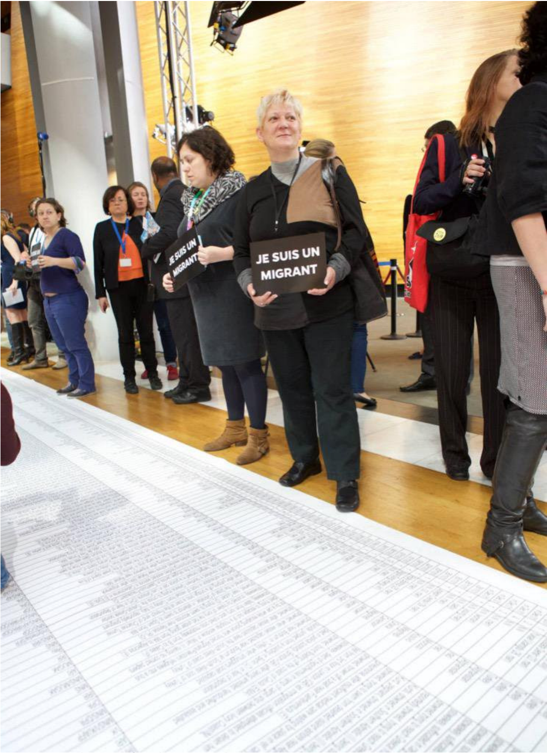
European Parliament, Strasbourg, 2015.