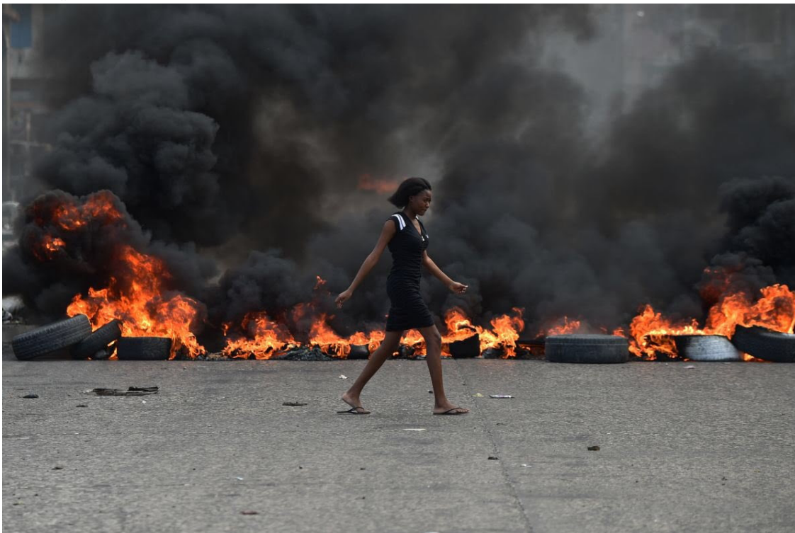
If you don't let us breathe, we won't let you breathe. Port-au-Prince, Haiti, 2019.

The US has used military aircrafts to bring in this modest aid, driven it to a warehouse and then said that the Venezuelans are not prepared to open an unused bridge for it. The entire process is political theatre. US Senator Marco Rubio went to that bridge – which has never been opened – to say in a threatening way that the aid ‘is going to get through’ to Venezuela one way or another. These are words that threaten the sovereignty of Venezuela and build up the energy for a military attack. There is nothing humanitarian here.