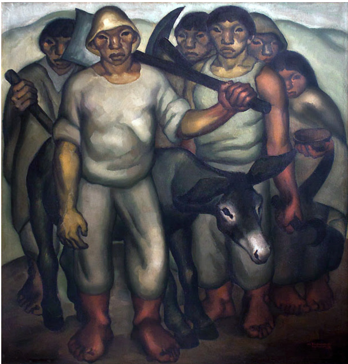
Oswaldo Guayasamín, The Workers , 1942.