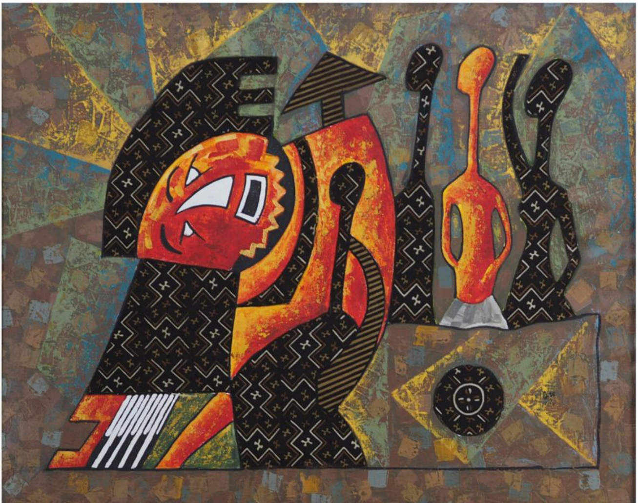
Suncréa (Mali), Racines ('Roots'), 2016.

A few months after reaching this defence cooperation agreement, the three countries withdrew from the ECOWAS regional bloc. Some political commentators have claimed that these events – combined with the ejection of French military forces from the region – ‘spell trouble’ for regional social security, economic development, political stability, and regional integration. What is behind the tidal wave sweeping through the Sahel, and what does it mean for the region?