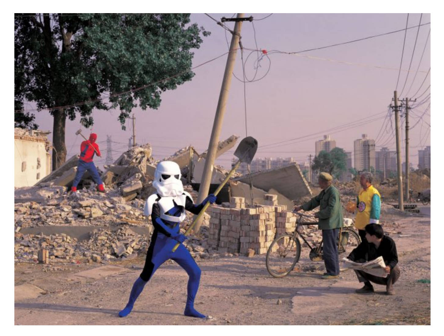
Housebreaker, Cao Fei, 2004.

The 2003 US war on Iraq began at a time when the United States appeared to be unassailable, the most powerful country in the world. Quagmire in Afghanistan and Iraq as well as the general economic crisis of 2007-08 has weakened US power. The ascent of Donald Trump to the US presidency and his attack on multilateral institutions has further set the US on a course of isolation or at least has dampened what appeared to be the overwhelming power of the US over world affairs.