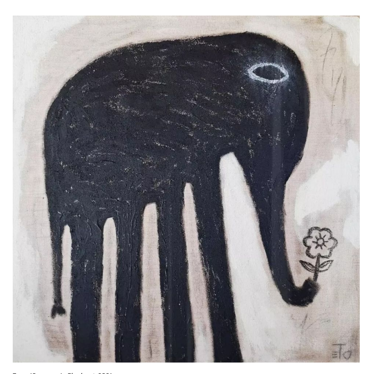
Tuyo (Germany), Elephant, 2021.