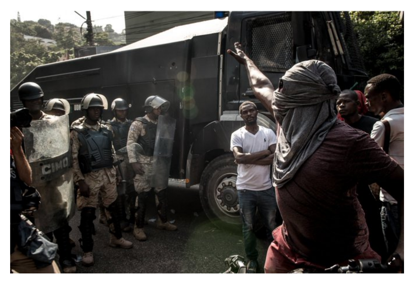
Port-au-Prince (Haiti), October 2019.

It is important to ask why people have taken to the streets, to ask about their political orientation. In each of these cases – Chile, Ecuador, Haiti, and Lebanon – the core issue is that the people of these countries have been defrauded by their own bourgeoisie and by external forces (pointedly, multinational corporations). The protests have targeted their governments, but that is only because these are protests that want to uphold democracy against capitalism. These protests could go deeper, or they could fizzle out. These are the main choices.