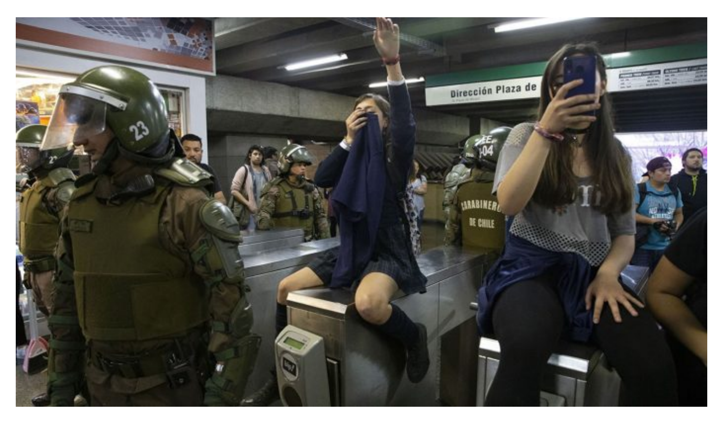
Santiago (Chile), October 2019.