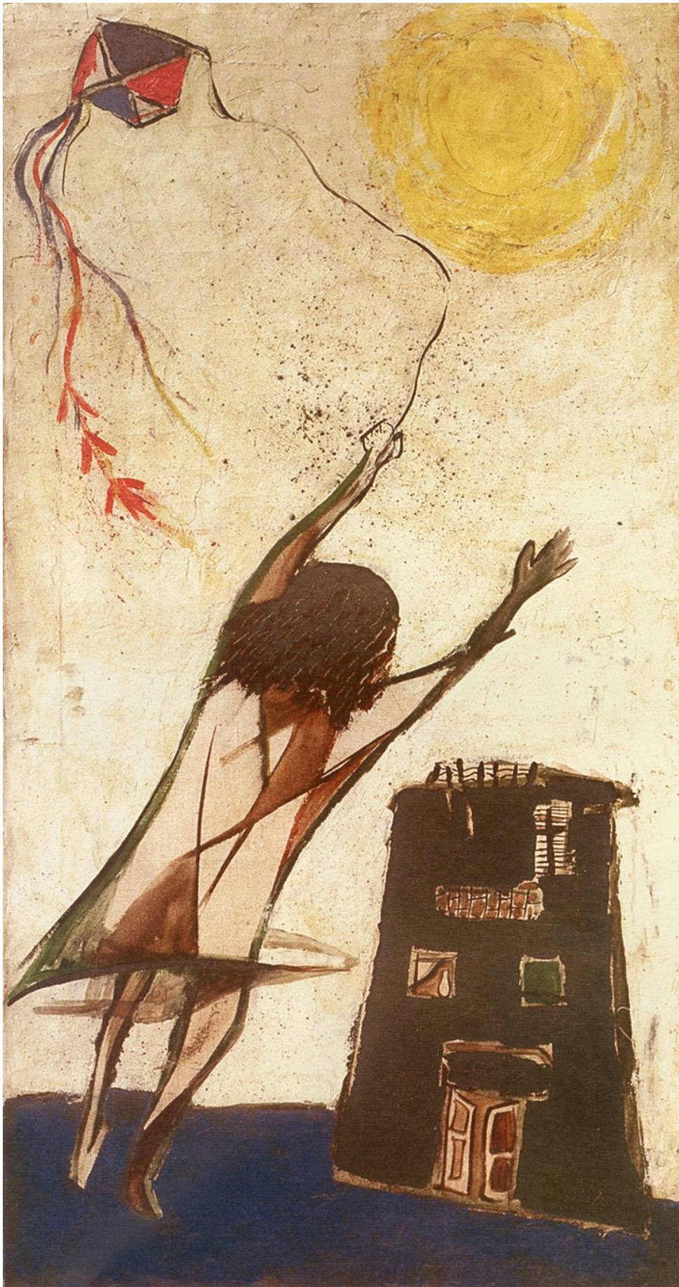
Gazbia Sirry, The Kite , 1960.