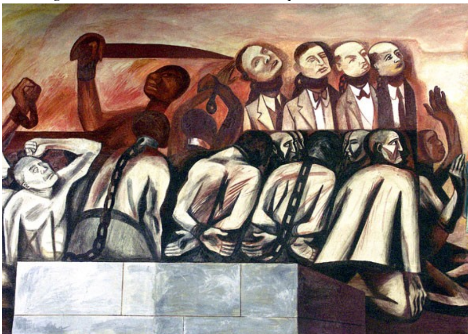
José Clemente Orozco. Struggle in the Orient: Slavery, Imperialism & Gandhi , 1930.