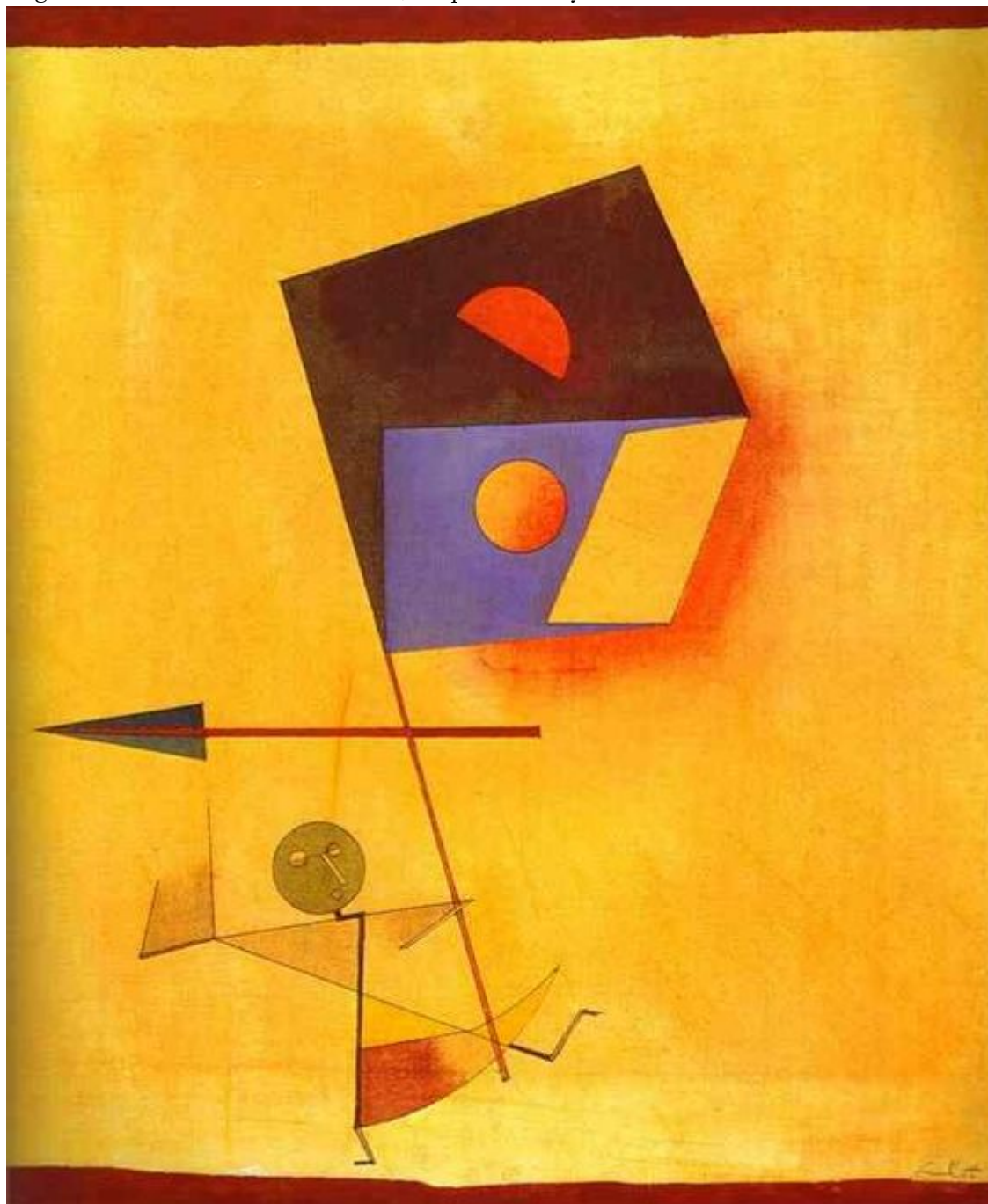
Paul Klee, Conquistador , 1930.

When the Mexican President Andrés Manuel Lopez Obrador tried to raise the question of Spanish colonisation of the Americas, he was rebuffed by the government of Spain and by the Vatican. None of the European powers would like to be honest about their history of theft and brutality. That is not on their agenda. They would like to forget. We would like to remind them, to speak directly to them.