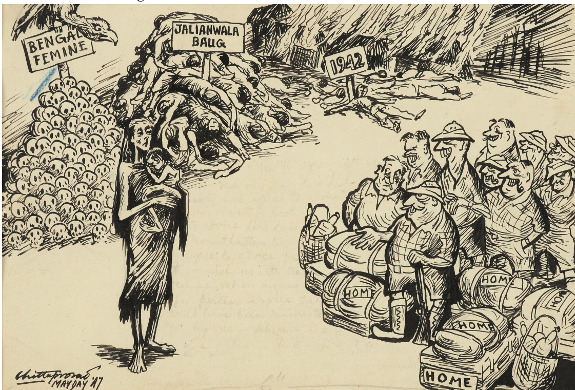
Chittaprosad, May Day , 1947.

Warren Hastings’ report about the famine is largely neglected. He is better known – if at all – for his attempted impeachment between 1788 and 1795 for personal corruption. Men like Hastings were known as nabobs – an Anglicisation of ‘nawab’, meaning an aristocrat. The term – used in England from as early as 1612 – meant a man who had gone to India and made a fortune in small order. In other words, someone who had stolen from India to aggrandise themselves and to build the wealth of the British Isles. Can we use words like ‘thief’ to describe these men, these nabobs ? Some writers like to be romantic about these men and the lives they built in India. A very popular book by William Dalrymple called White Mughals focuses on Englishmen who ‘went native’. There is glamour here, the ‘mingling of culture’ that Dalrymple focuses on. But there is also a terrible stench here. There is the theft of the wealth produced by underfed peasants and workers. There are the bodies in Bengal that lay on the streets, dead from hunger in 1770.