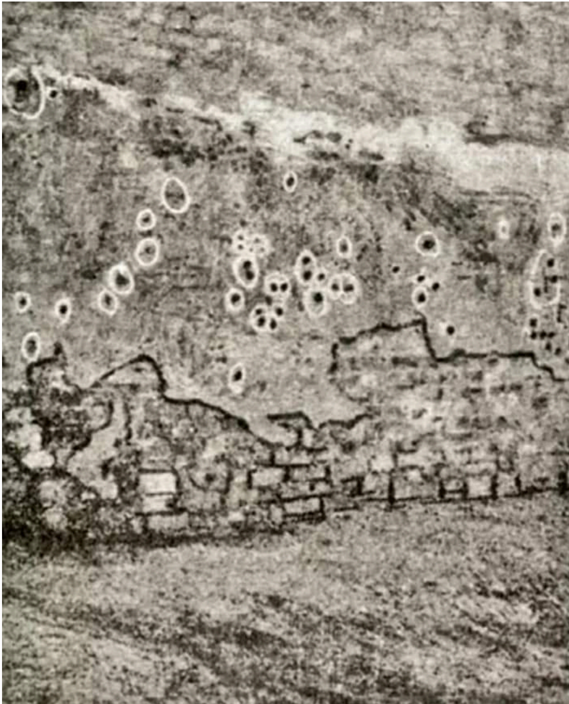
Bullet holes on the walls of Jallianwalla Bagh, Amritsar, India.