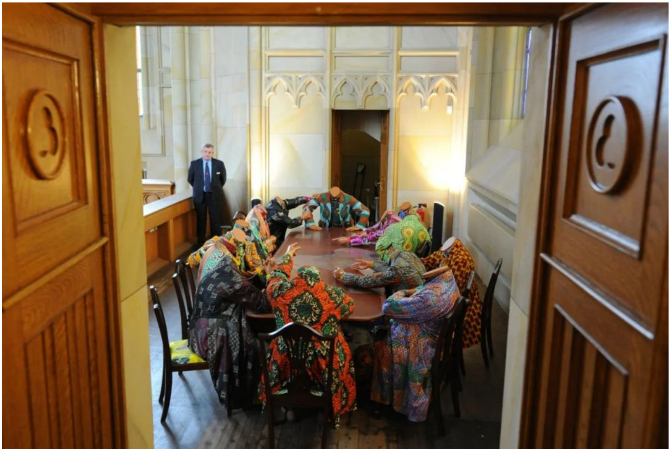
Yinka Shonibare (Nigeria), Scramble for Africa , 2003.

With the signing of the US-Japan Security Treaty in 1951, Japan's Prime Minister Shigeru Yoshida accepted the dominance of the US military over his country but hoped that the Japanese state would be able to focus on economic development. Similar doctrines were articulated in Europe.