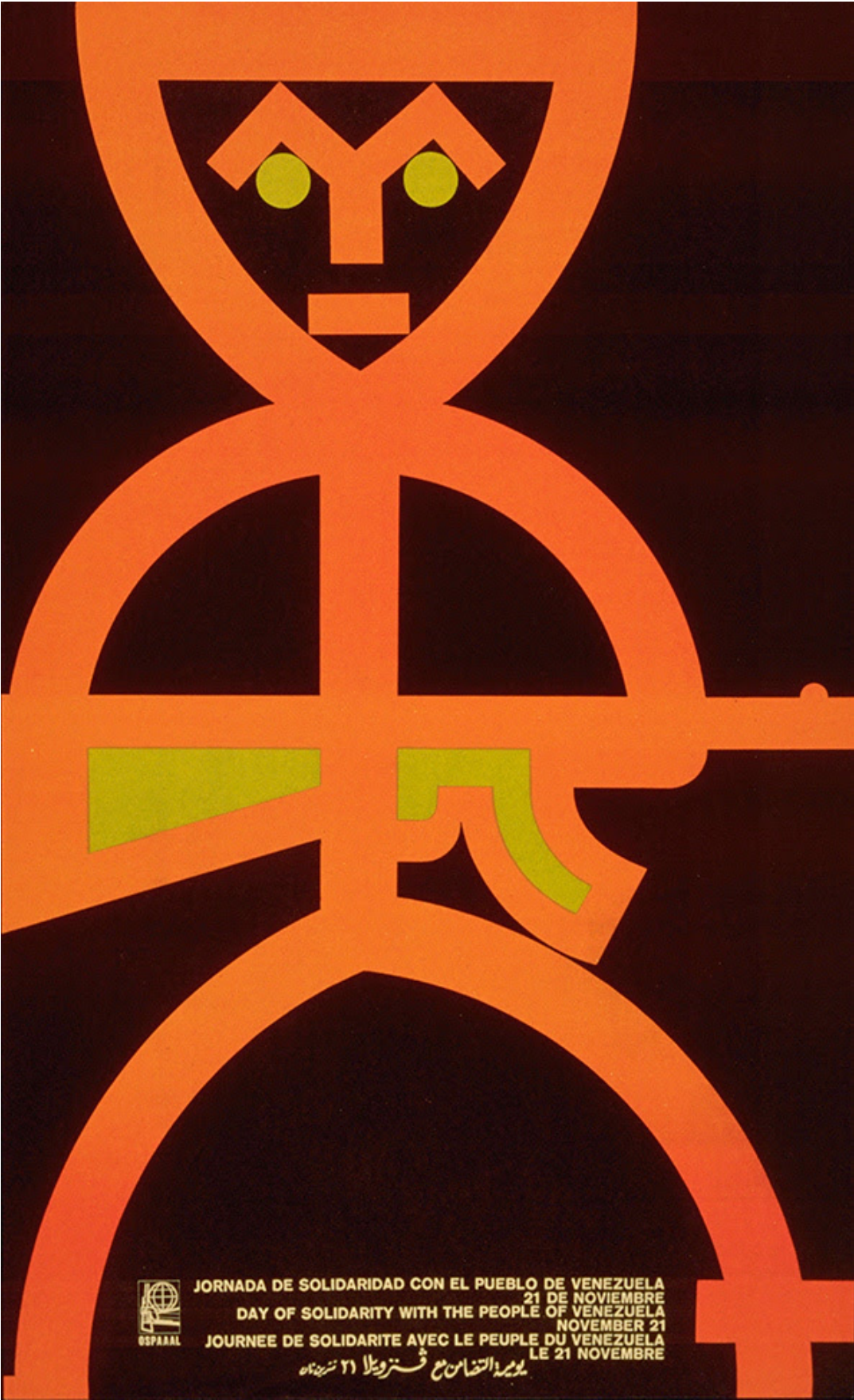
Faustino Perez, Organisation of Solidarity with the People of Asia, Africa and Latin America, Day of Solidarity with the People of Venezuela, 1969.