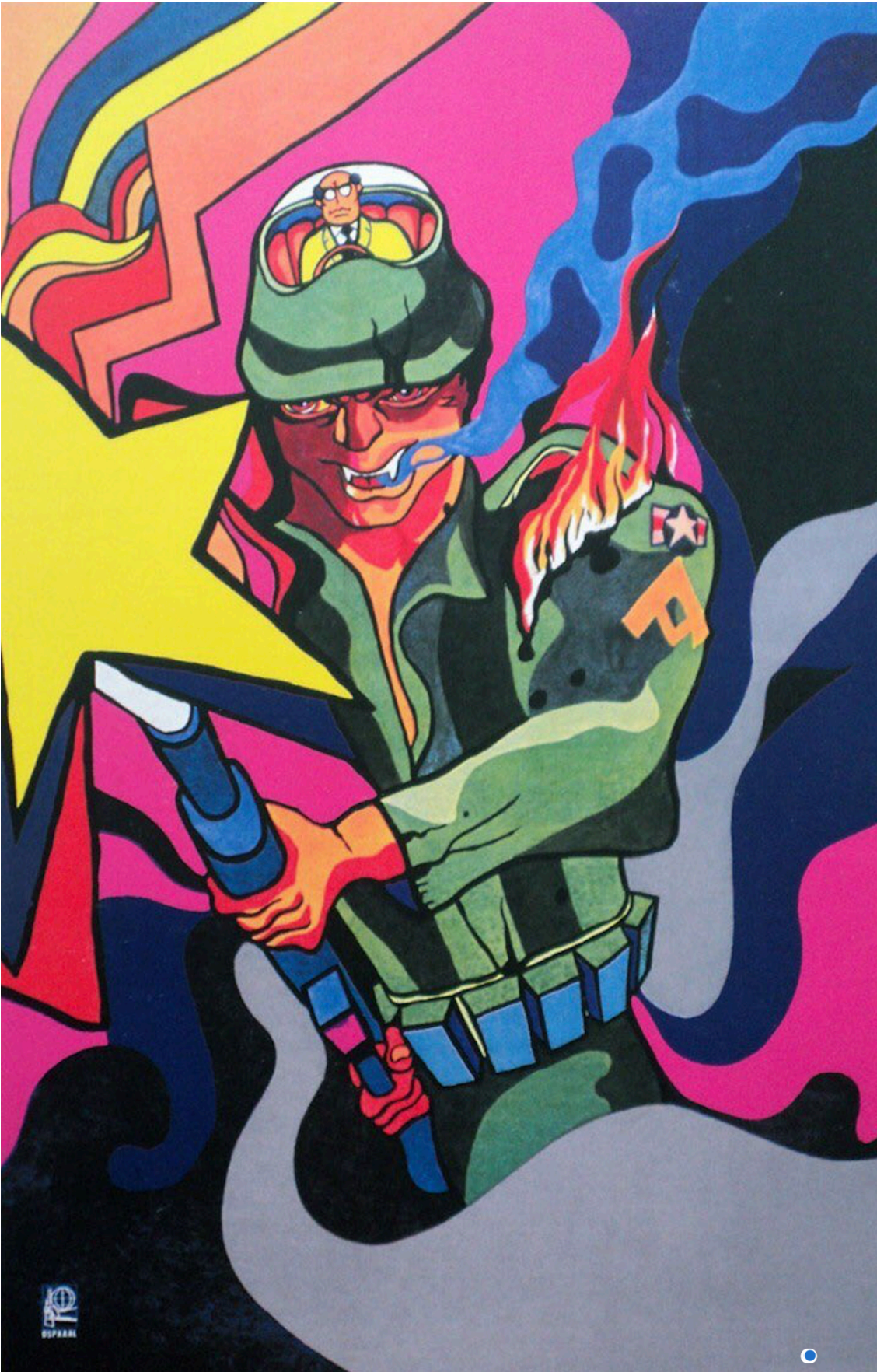
Alfredo Rostgaard, OSPAAAL poster, 1969.