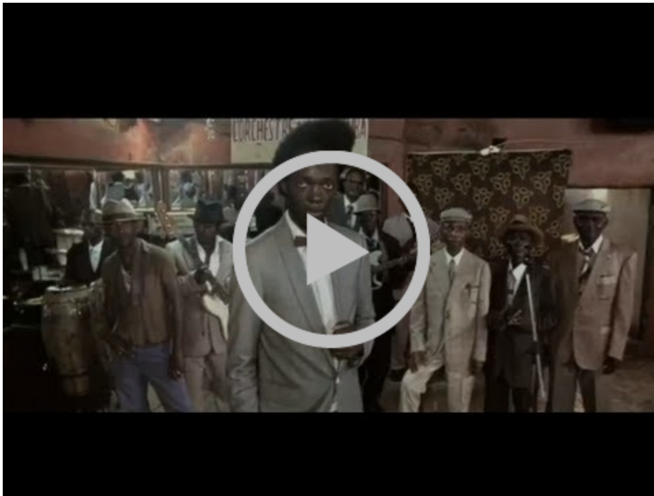
Baloji, Le Jour d'Après/Siku Ya Baadaye (Indépendance Cha-Cha), 2011.