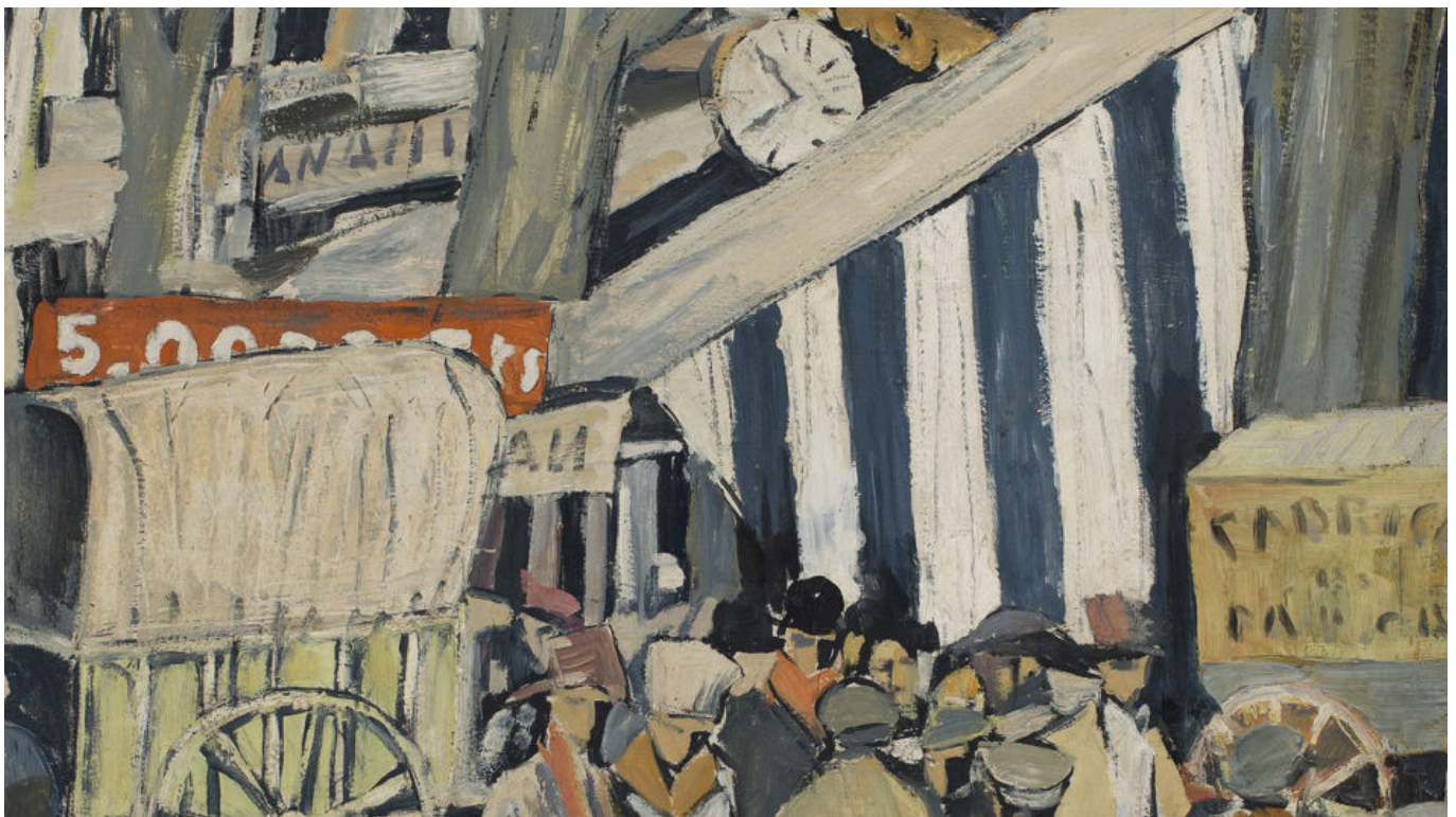
Joaquín Torres-García (Uruguay), Entoldado (La Feria) [Canopy [The Fair]] , 1917.

The political and cultural divisions that widened during the Trump years continue to inflict a heavy toll on US society, including over the government's ability to control the COVID-19 pandemic. Basic protocols to avoid infections are not universally followed. Misinformation related to COVID-19 has spread as rapidly as the virus in the United States, where large numbers of people believe sensational claims: for example, that pregnant women should not take the vaccine, that the vaccine promotes infertility, and that the government is hiding the data on deaths caused by the vaccines.