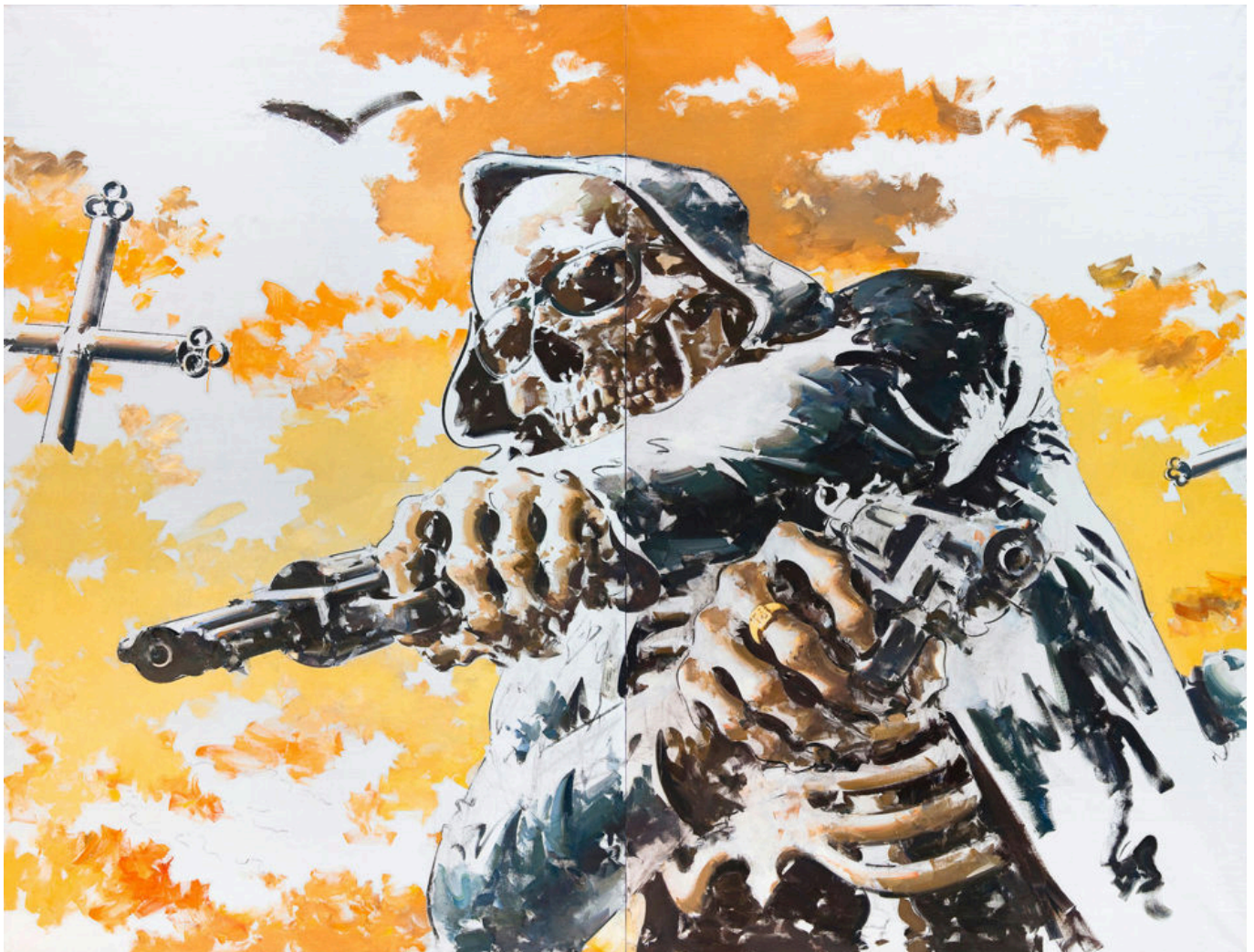
Vasiliy Tsagolov (Ukraine), Untitled , 2008.

the strengthening of pro-Western and anti-Russian forces. Yanukovych was removed and replaced in a parliamentary coup by a string of US-backed leaders (Arseniy Yatsenyuk and Petro Poroshenko). President Poroshenko (2014–2019) drove a Ukrainian nationalist agenda around the slogan armiia, mova, vira ('military, language, faith'), which became reality with the end to military cooperation with Russia (2014), the enacting of legislation which made Ukrainian 'the only official state language' and restricted the use of Russian and other minority languages (2019), and the Ukrainian church breaking ties with the Patriarch Kirill of Moscow (2018). These measures, along with the empowerment of neo-Nazi elements, shattered the country's pluri-national compact and produced serious armed conflict in the Donbass region of eastern Ukraine, which is home to a substantial Russian-speaking ethnic minority. Threatened by state policy and neo-Nazi militias, this minority population sought protection from Russia. To mitigate the dangerous ethnic cleansing and end the war in the Donbass region, all parties agreed to a set of de-escalation measures, including ceasefire, known as the Minsk Agreements (2014–15).