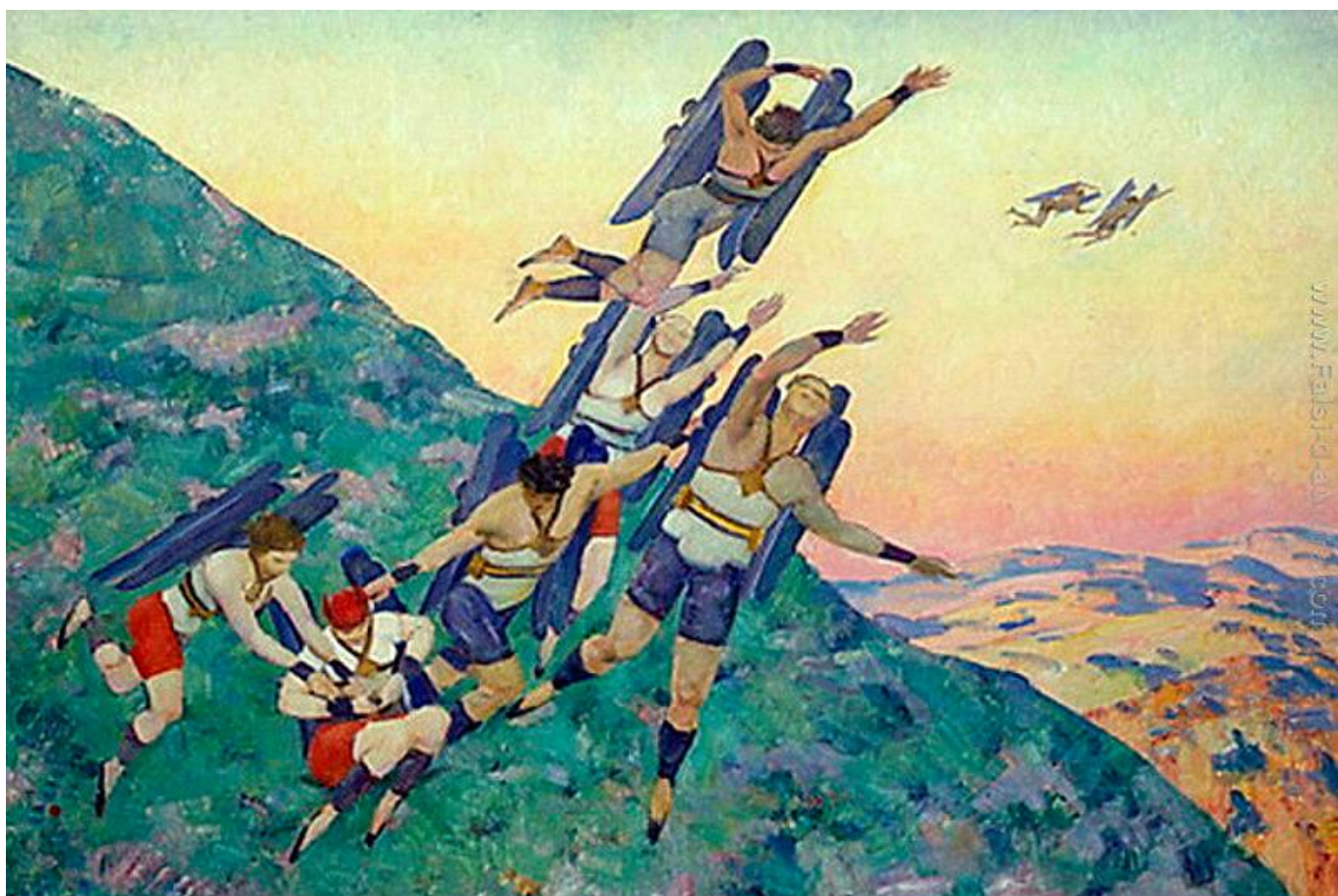
Konstantin Yuon (USSR), People of the Future , 1929.