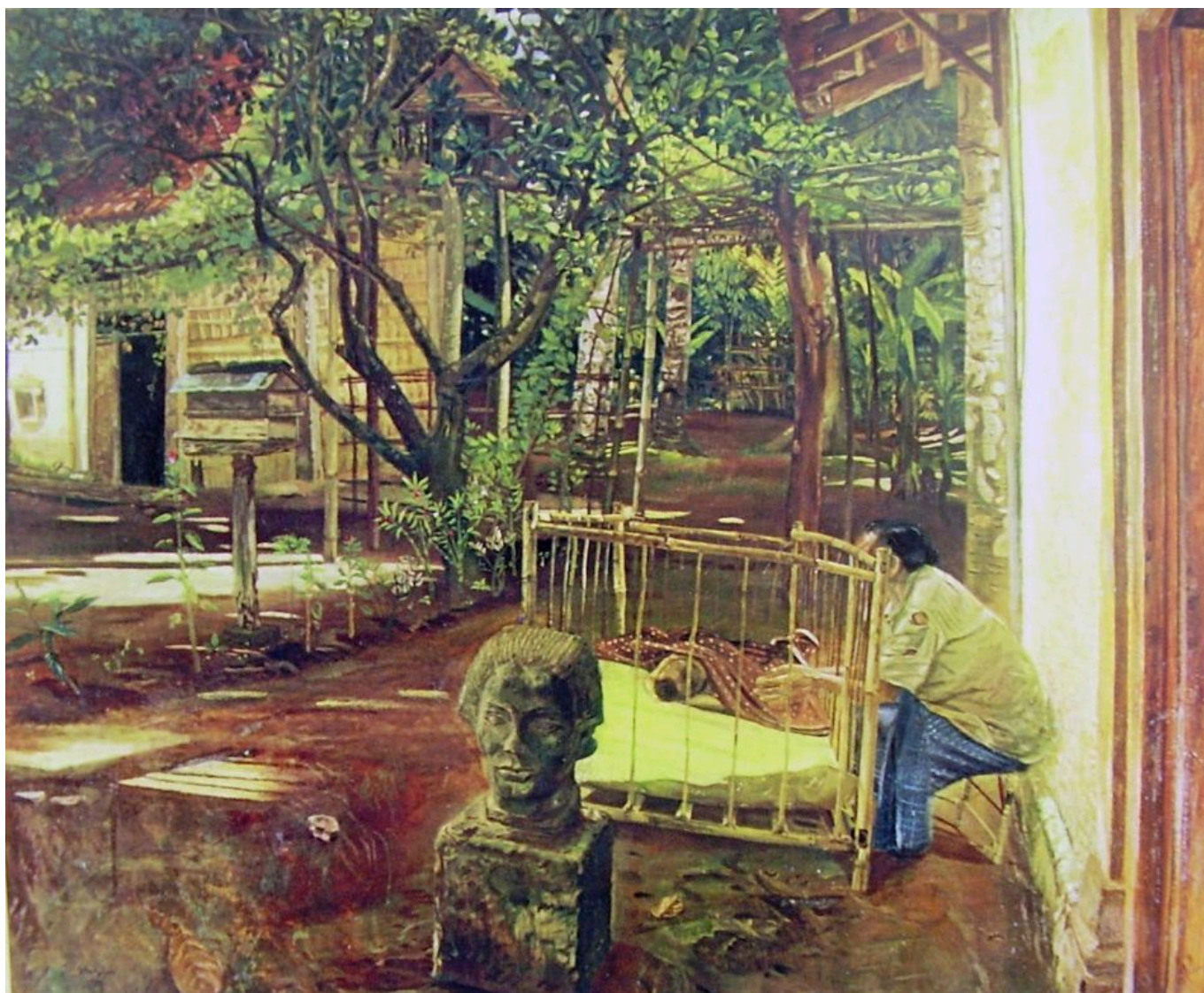
S. Sudjojono (Indonesia), Di Dalam Kampung ('In the Village'), 1950.

Secondly, it was astounding to countries such as China, India, and Indonesia to be asked by the G20 to provide liquidity to the Global North's desiccated banking system in 2007–08. The confidence of these developing countries in the West decreased, while their own sense of themselves increased. It this change in circumstances that led to the formation of the BRICS bloc in 2009 by Brazil, Russia, India, China, and South Africa – the 'locomotives of the South', as was theorised by the South Commission in the 1980s and later deepened in their little-read 1991 report . China's growth by itself was astounding, but, as the UN Conference on Trade and Development (UNCTAD) noted in 2022, what was fundamental was that China was able to achieve structural transformation (namely, to move from low-productivity to high-productivity economic activities). This structural transformation could provide lessons for the rest of the Global South, lessons far more practical than those offered by the debt-austerity programme of the International Monetary Fund.