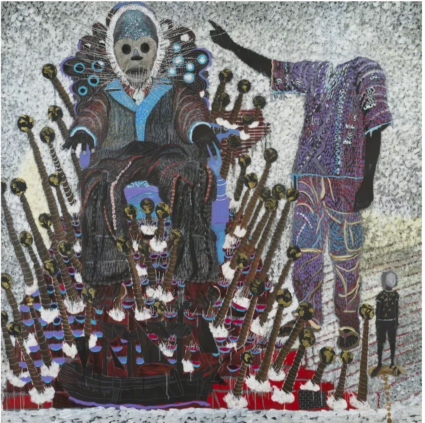
Omar Ba (Senegal), Promenade masquée 2 ('Masked Walk 2'), 2016.

In 2005, then UN Secretary-General Kofi Annan wrote a report entitled In Larger Freedom in which he called for the expansion of the UNSC from fifteen to twenty-four members. This expansion, he said, must be done on a regional basis, rather than allocating permanent seats along historical axes of power (as with the Big Five). One of the models that Annan proposed would provide two permanent seats for Africa, two for Asia and the Pacific, one for Europe, and one for the Americas. This allocation would more closely represent the regional distribution of the global population, with the UNSC's centre of gravity moving towards the more