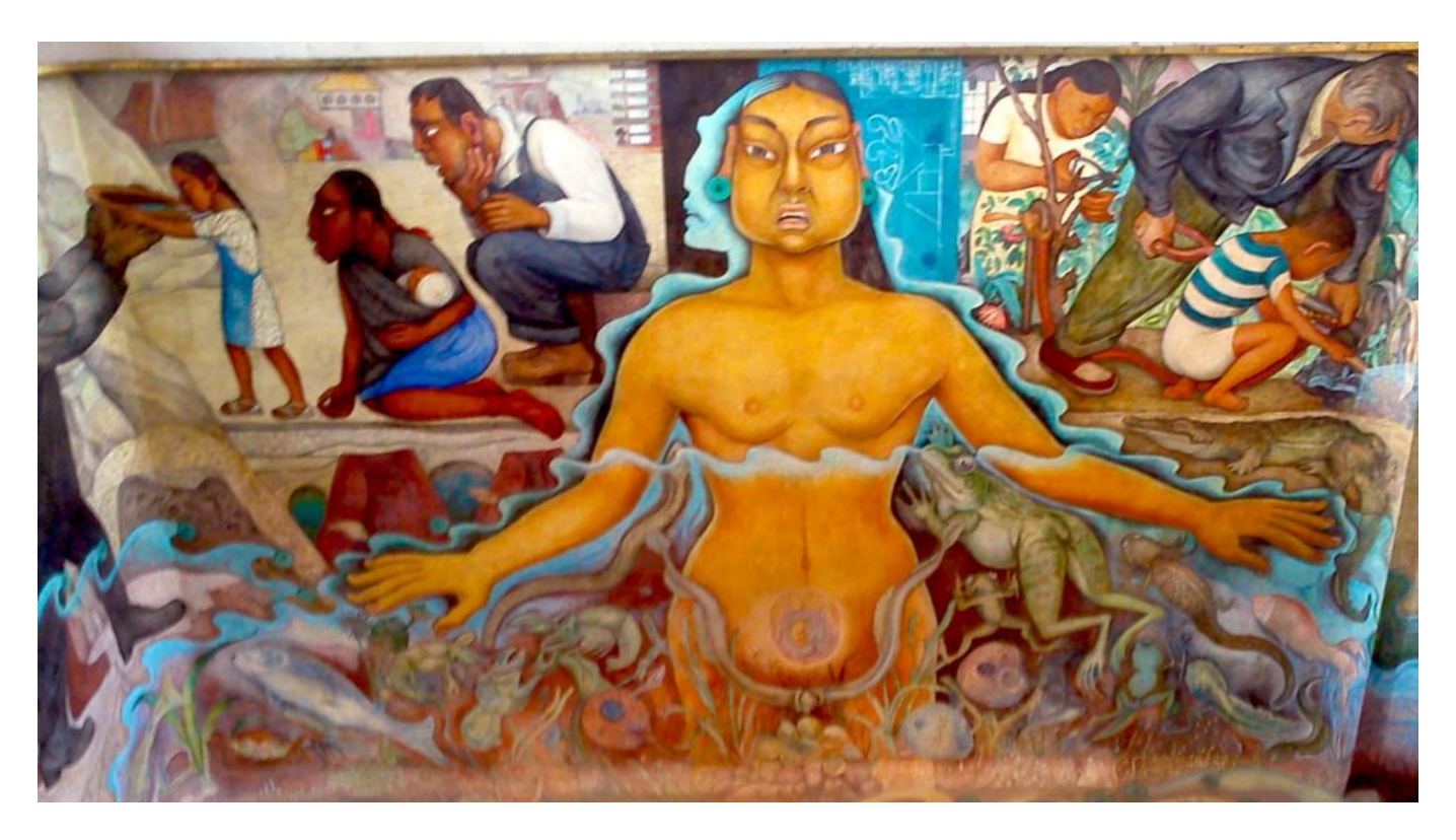
Diego Rivera (Mexico), El Agua, Origen de la Vida ('Water, Origin of Life'), 1951.