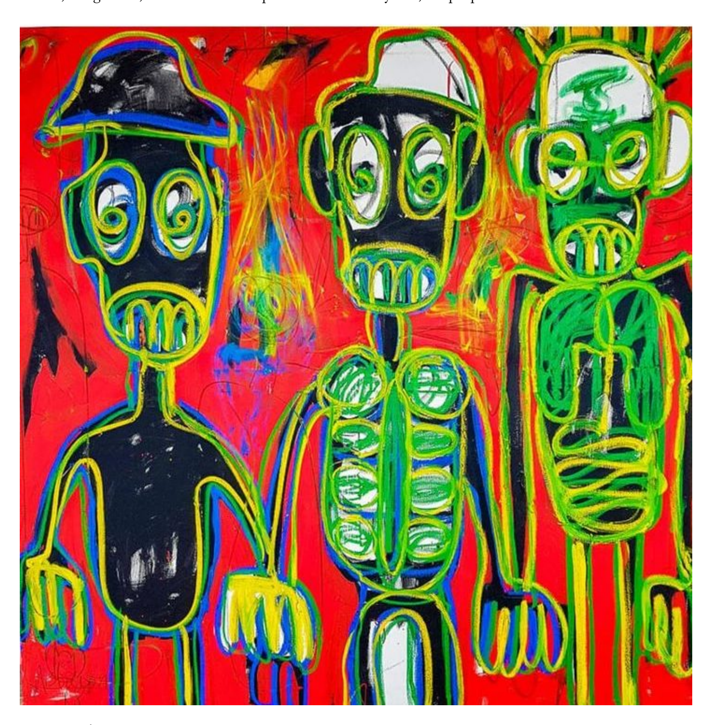
Aboudia (Côte d'Ivoire), Les trois amis II ('The Three Friends II'), 2018.

The lack of access to public toilets is by itself a serious danger to women in cities across the world, such as Dhaka, Bangladesh, where there is one public toilet for every 200,000 people.