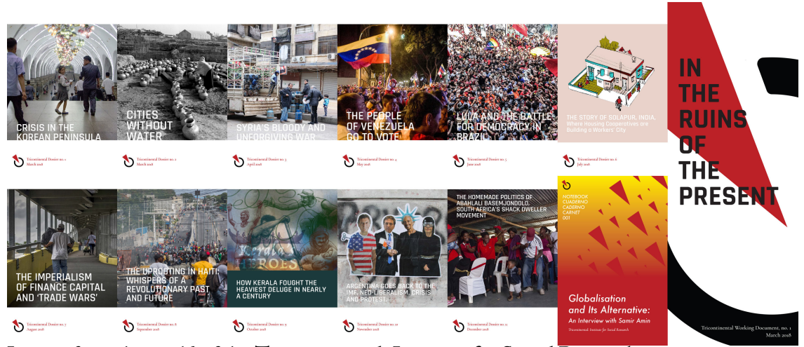
Images from the world of the Tricontinental: Institute for Social Research .