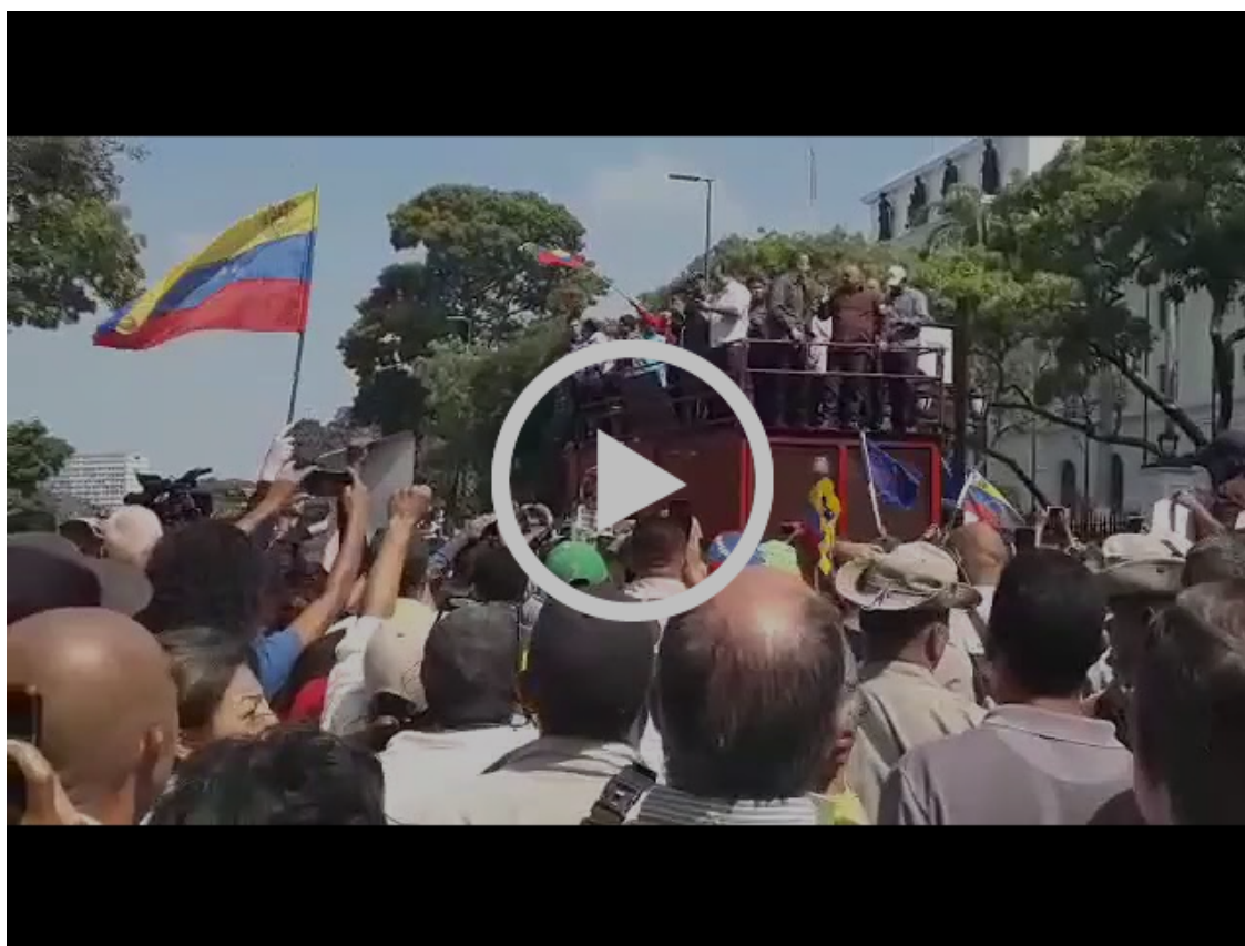
Mayor of Caracas Erika Farías Peña, on 30 April at a mass demonstration.