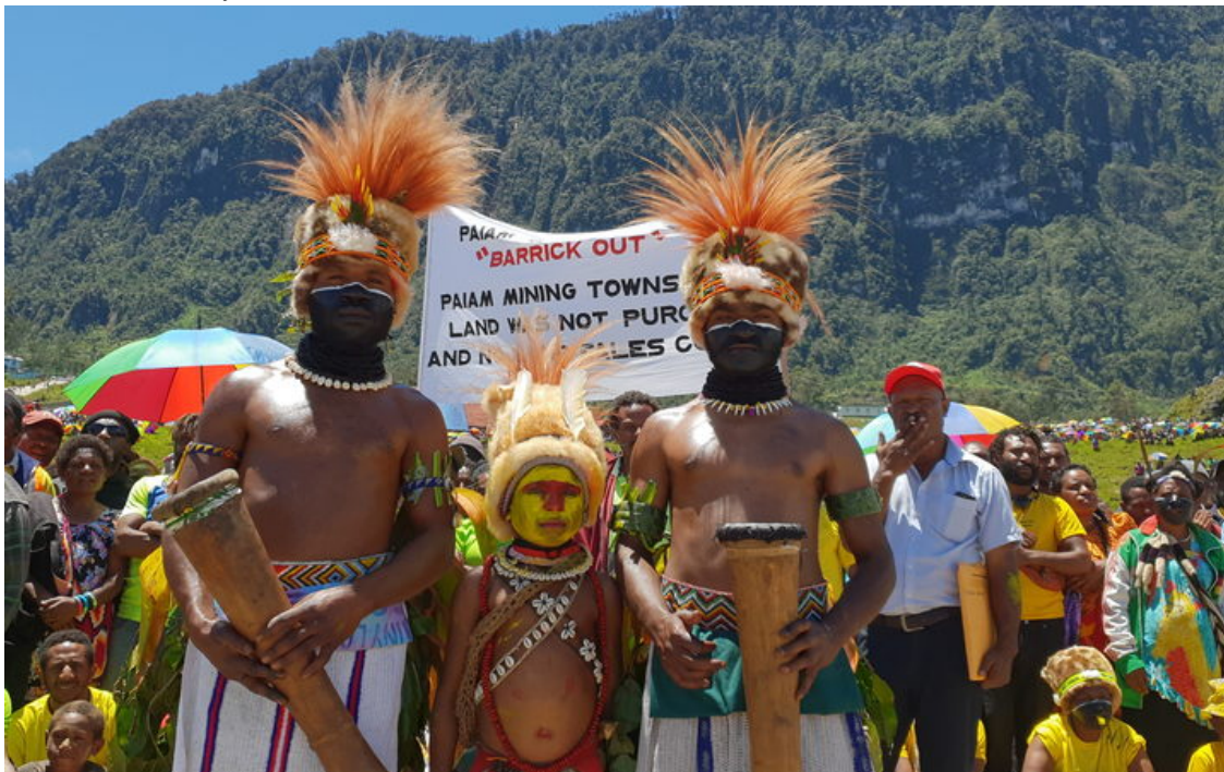
Protest at the Porgera Gold Mine, 2018.