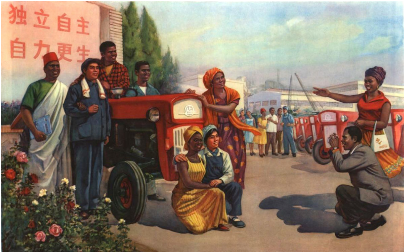
Guo Hongwu (China), 革命友谊深如海 ('Revolutionary Friendship Is as Deep as the Ocean'), 1975.

The Western-backed governments that followed these coups often reversed the policies to exercise national sovereignty and build continental unity. For instance, in 1966, the military leaders of Ghana's National Liberation Council began to gut the policy of establishing quality public education and an efficient public sector with industrialisation and continental trade at its centre. Import-substitution policies that had been important to the new Third World states were rejected in favour of exporting cheapened raw materials and importing expensive finished products. The spiral of debt and dependency wracked the continent. This situation was worsened by the International Monetary Fund's Structural Adjustment Programmes, set in motion during the worst of the 1980s debt crisis. A 2009 research paper from the South Centre noted that 'the continent is the least industrialised region of the world, while the share of sub-Saharan Africa in global manufacturing value added actually declined in most sectors between 1990 and 2000'. Indeed, the South Centre paper referred to the situation in Africa as one of 'de-industrialisation'.