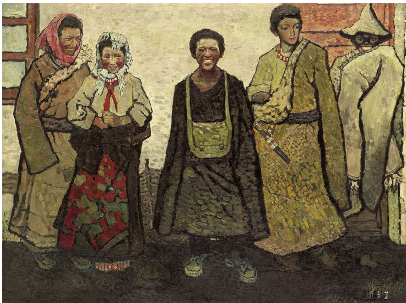
Zhou Chunya (China), New Generation Tibetan , 1980.