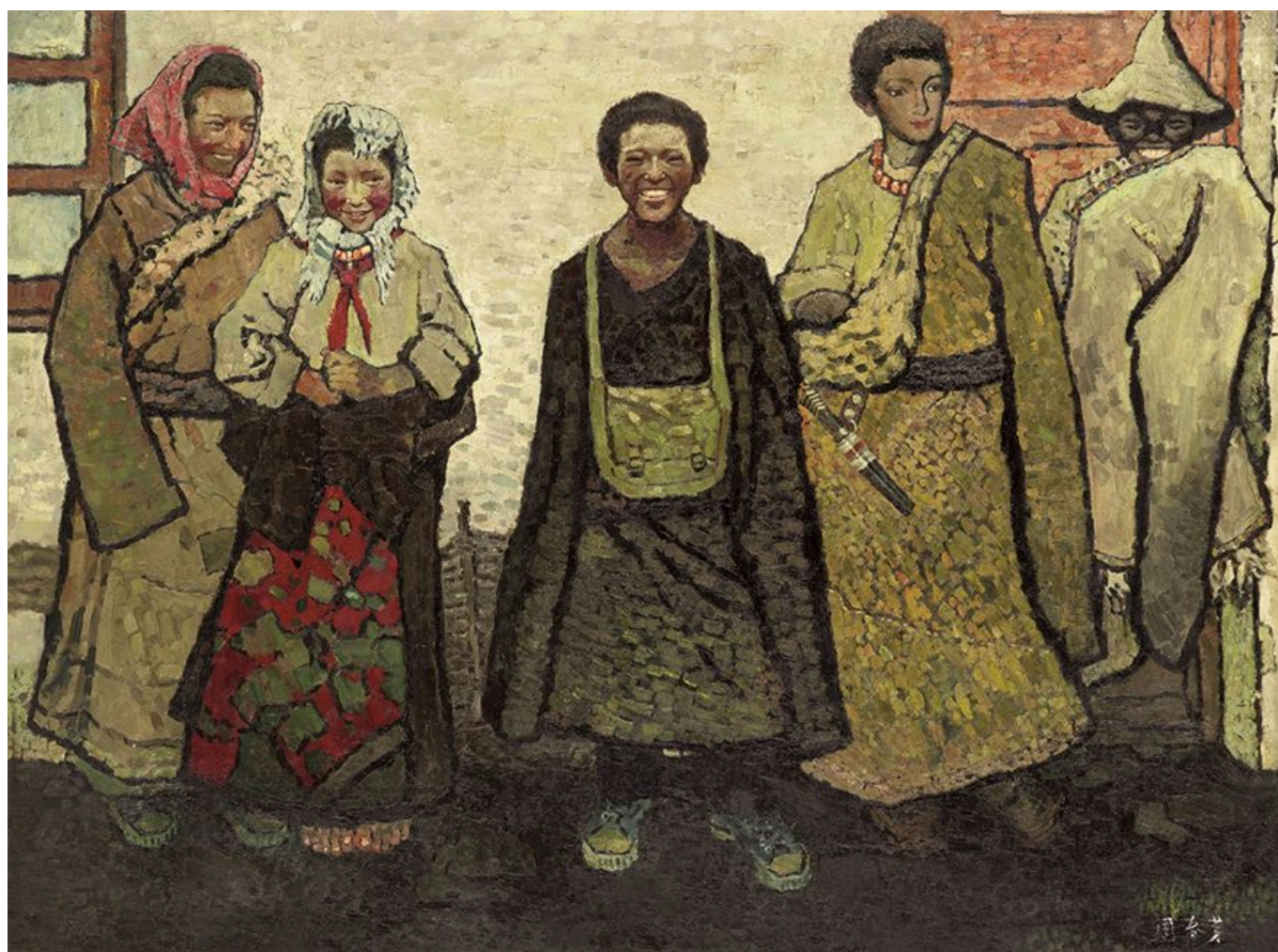
Zhou Chunya (China), New Generation Tibetan , 1980.