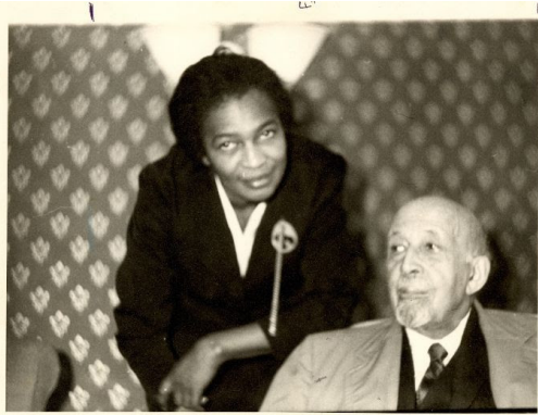
Claudia Jones with W. E. B. Du Bois, London, 1960.