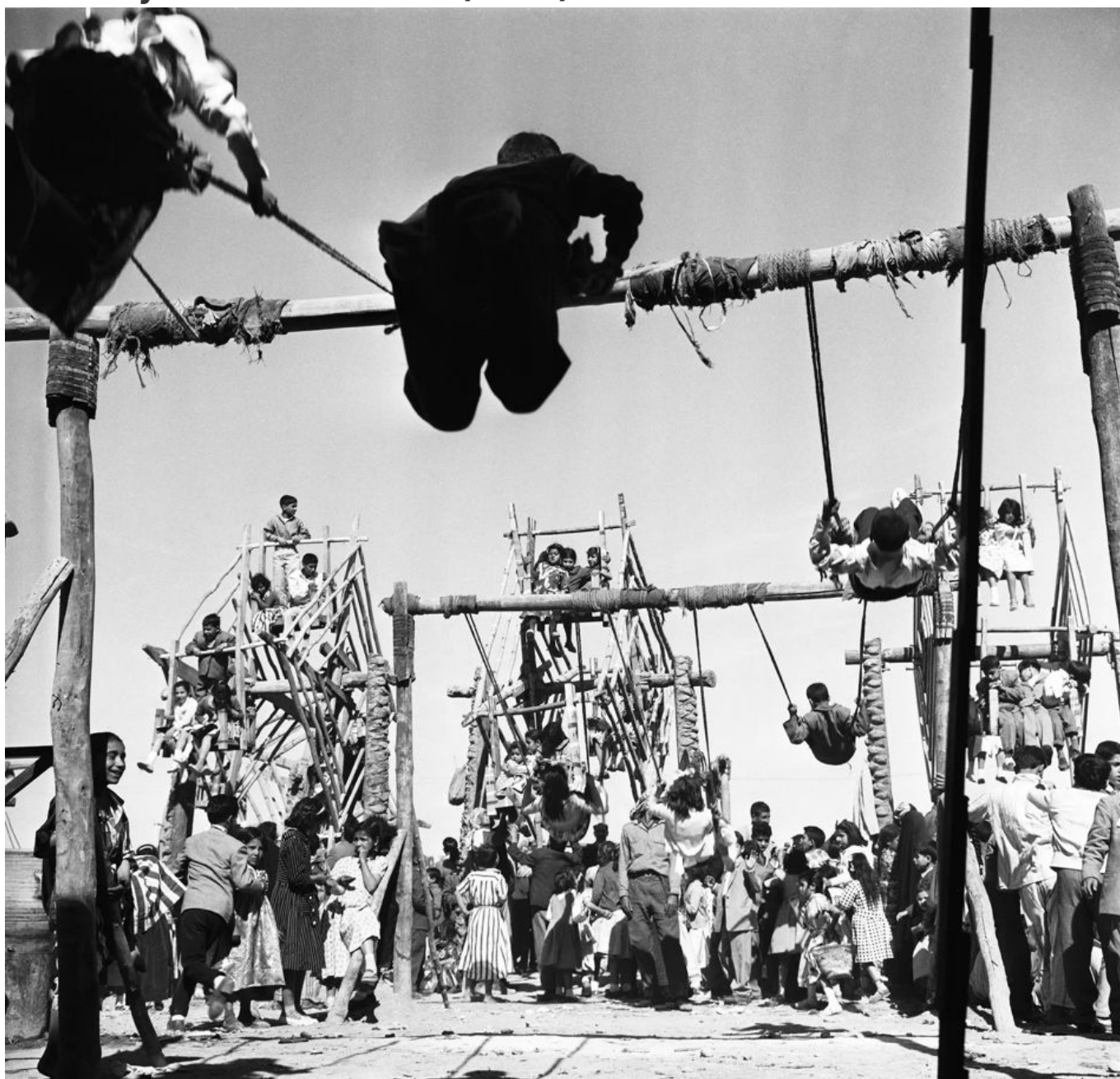
Latif al-Ani (Iraq), Eid festivities in Baghdad, 1959.