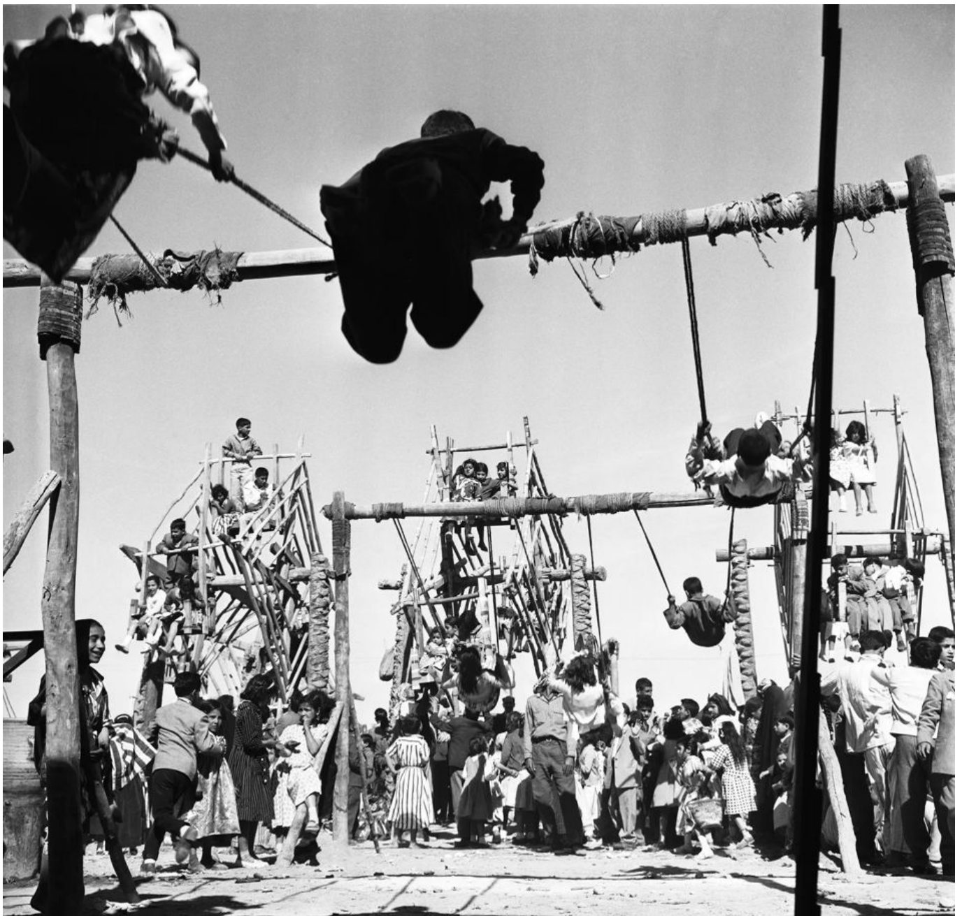
Latif al-Ani (Iraq), Eid festivities in Baghdad, 1959.