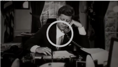
O Dia que Durou 21 Anos (for English, you have to rent it).