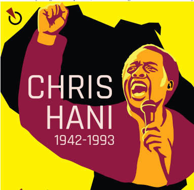
the tricontinental.org (translations) Instituto for Social Research | Instituto Tricontinental de Investigación Social

Violence has become an instrument of 'democracy'. The homophobic use of it against activists is from one end of the planet to another. We have become inured to the violence done to political activists, cynicism itself a weapon of the oligarchy against hope. The murder of the South African communist Chris Hani in 1993, just before the country emerged out of apartheid, was a loud message that the South African 'decayed elite' would not tolerate anything other than its control over the country's wealth and resources. It would allow 'democracy', if this democracy would not challenge its gains.