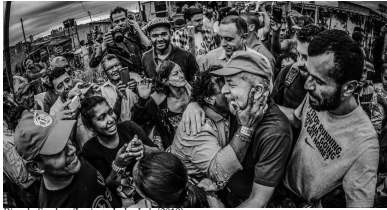
Lula (2018).