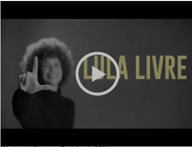
Video from the Campaign to Free Lula, 1 April 2019.