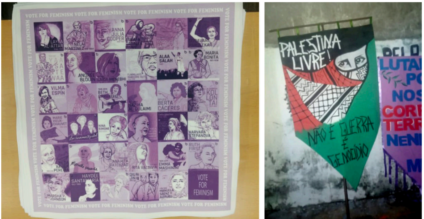
Handkerchief from a feminist group in South Korea (left); banner created by women of the Landless Workers’ Movement (MST) in Brazil, which reads ‘Free Palestine! It’s not war, it’s genocide’ (right).