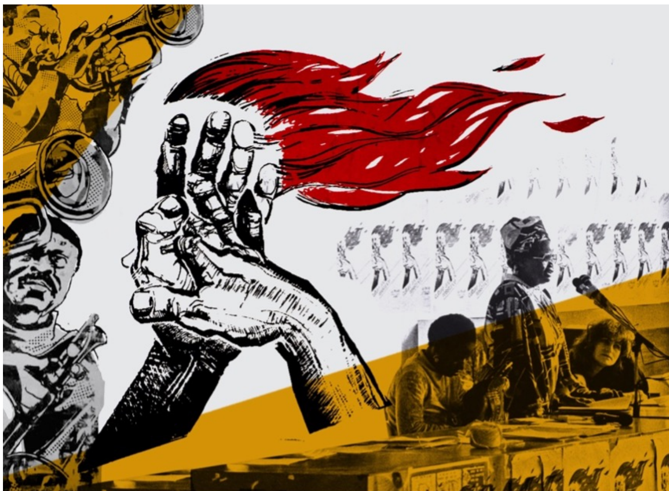
Cover art of Culture as a Weapon of Struggle: Medu Art Ensemble and South African Liberation .