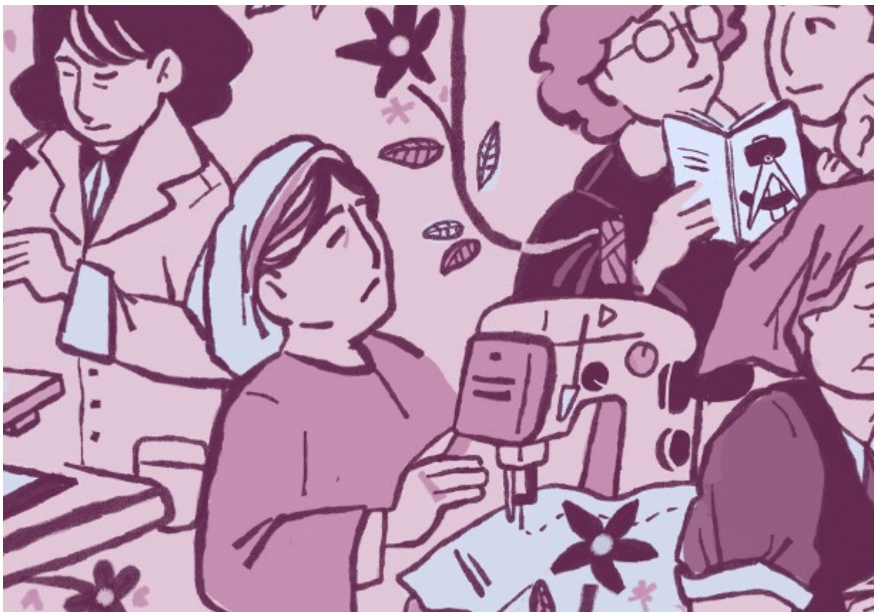
Cover artwork of Interrupted Emancipation: Women and Work in East Germany (March 2024) by Daniela

To celebrate International Women’s Working Day – a day that was won through the struggle of communist women – the International Peoples’ Assembly together with Capire, ALBA Movements, and Utopix launched an online exhibition of feminist posters in solidarity with Palestine. Forty-four posters from seventeen countries were produced for the exhibit, with entries stemming from Poland to Puerto Rico, China to Colombia, South Africa to Sweden.