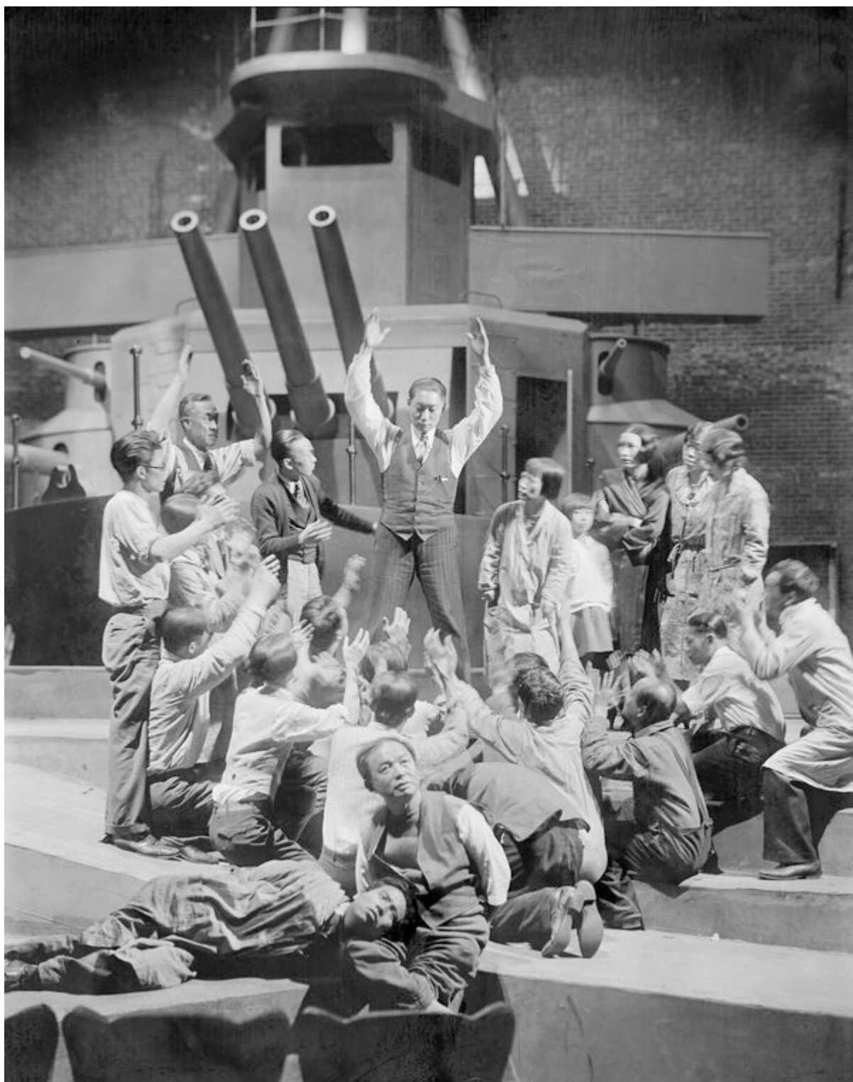
Roar, China! Broadway production, New York, 1930.

Tretyakov's play found its way to many places such as the Indian People's Theatre Association. In 1942, the play was adapted to the struggle against Japanese fascism in Asia, and the US and English figures were replaced by Japanese characters. As noted in the publication's introduction, this 'anti-fascist' play was intended to be performed for worker and peasant audiences and to show links between Chinese and Indian