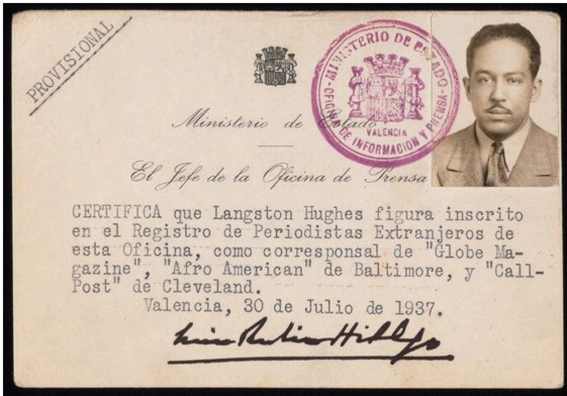
Langston Hughes' registration as a journalist in Spain, July 1937.

His poem appeared in Volunteer for Liberty , an English-language weekly newspaper for the International Brigades, comprised of fighters from around the world who were defending the Spanish Republic against Franco's fascism. Hughes had been sent to Spain as a correspondent to cover the stories of African-American volunteers who had joined the Abraham Lincoln Brigade. Hughes wrote in his autobiography I Wonder as I Wander , 'Why would a Negro come way over to Spain to help solve Spain's problems – perhaps with his very life'. He sought to find out.