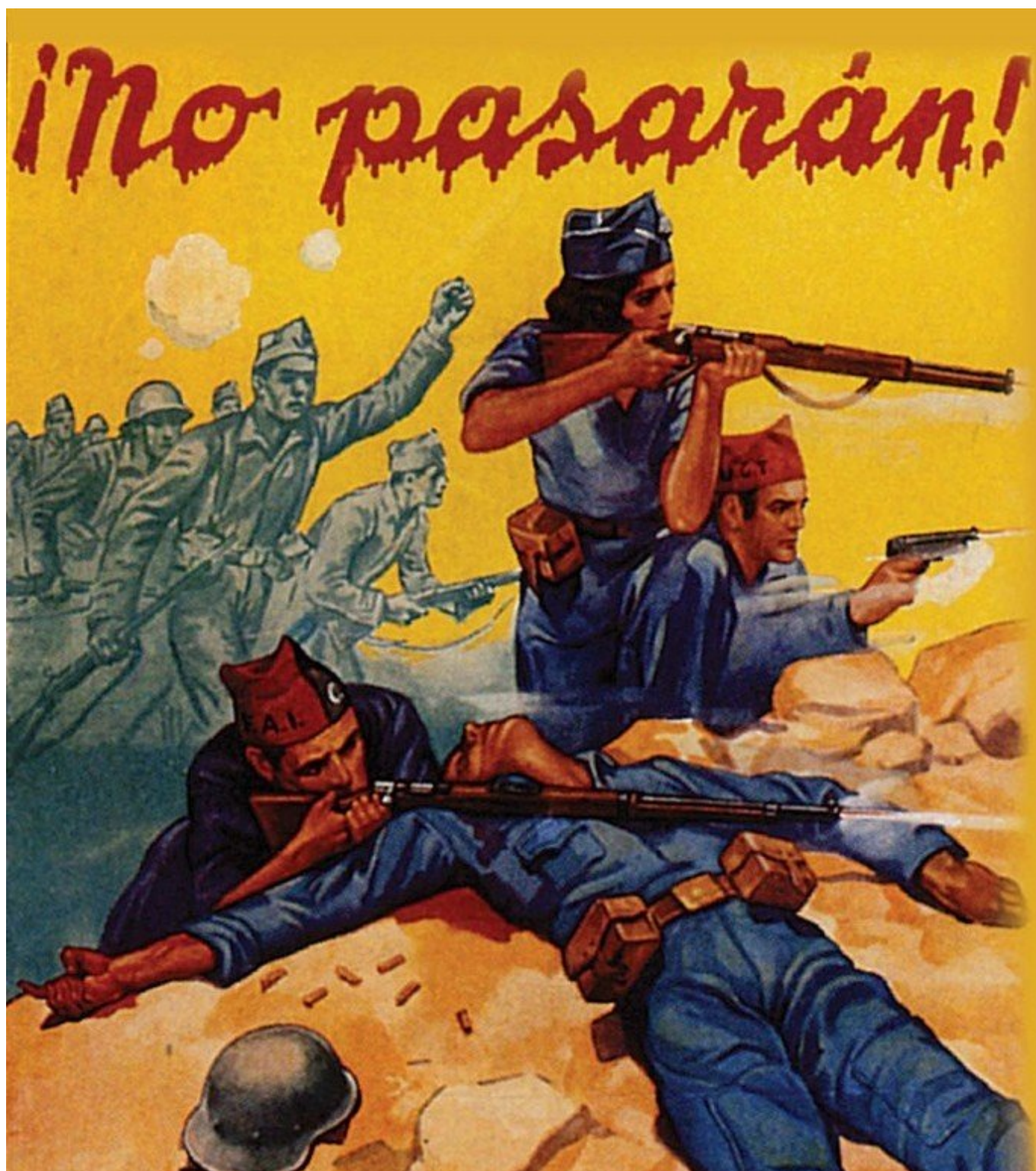
¡No pasarán! ('They shall not pass!') poster during the Spanish Civil War, 1930s.

The Popular Front strategy coming out of the Communist International's seventh congress in 1935 was to unify the world's anti-fascist forces, from progressive liberals to communists. This included material support, such as Soviet assistance and organisation of international brigades in Spain, and the promotion of anti-fascist culture and intellectual networks, with Hughes as one of the prominent figures.