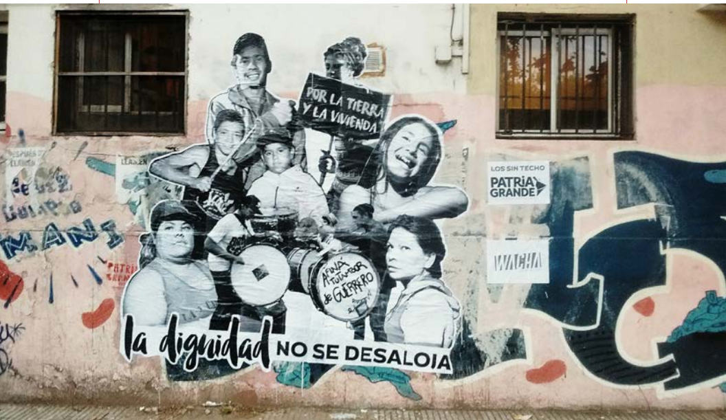
'Dignity is not evicted', an intervention that took place during the March of the Unhoused, 15 January 2017, Mar del Plata, Argentina. Colectivo Wacha