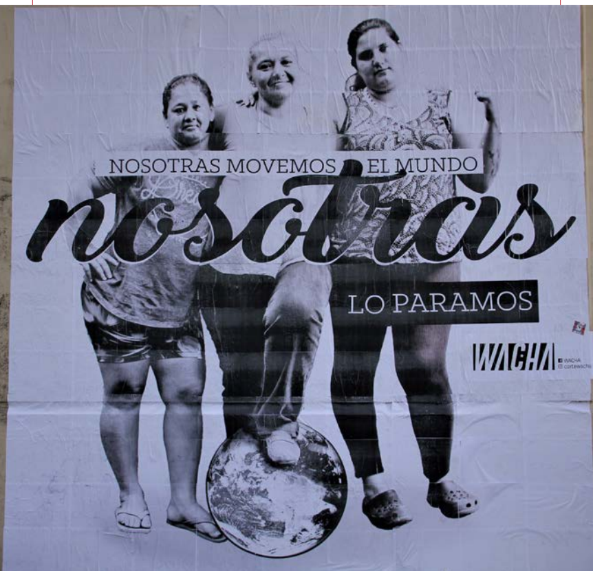
'We move the world, we stop it', an intervention that took place during the 8M March based on a photograph taken of comrades from the Movement of Excluded Workers, La Plata, Argentina. Colectivo Wacha