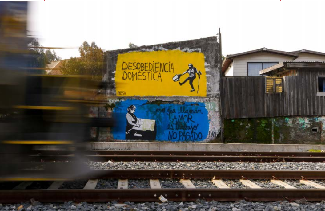
Ailén Possamay, Domestic disobedience / What they call love is unpaid labour , Concepción, Chile, 2019.