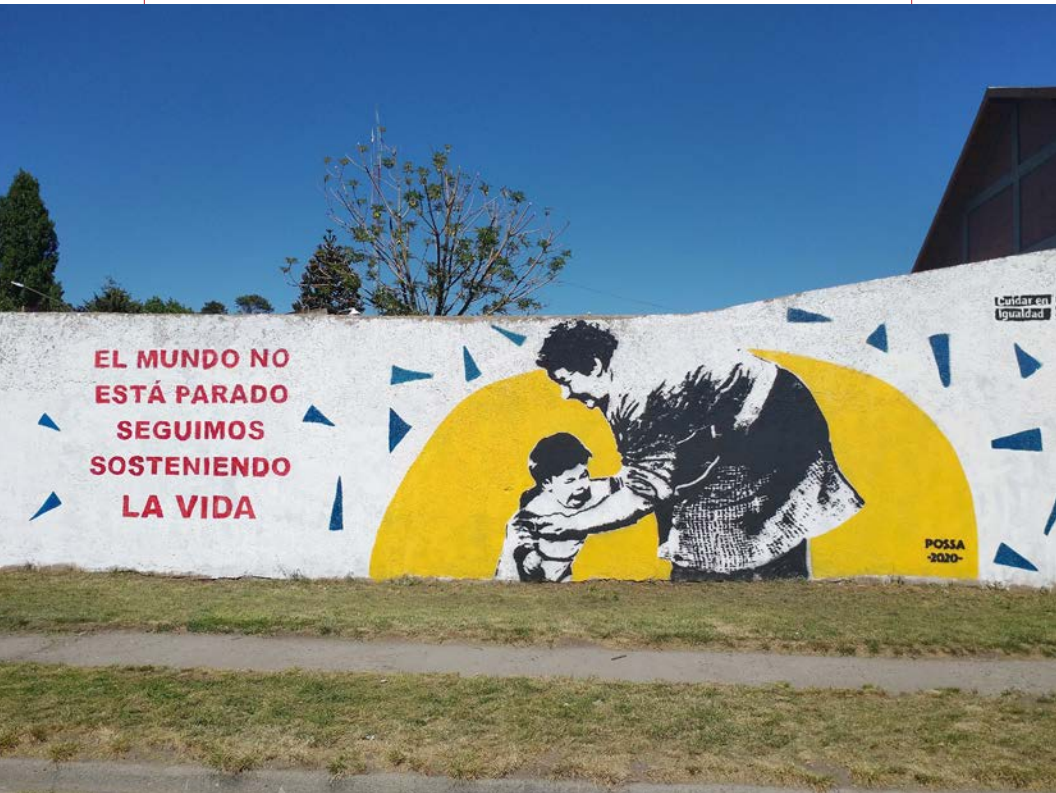
Ailén Possamay, The world has not stopped; we continue to sustain life , 2019.