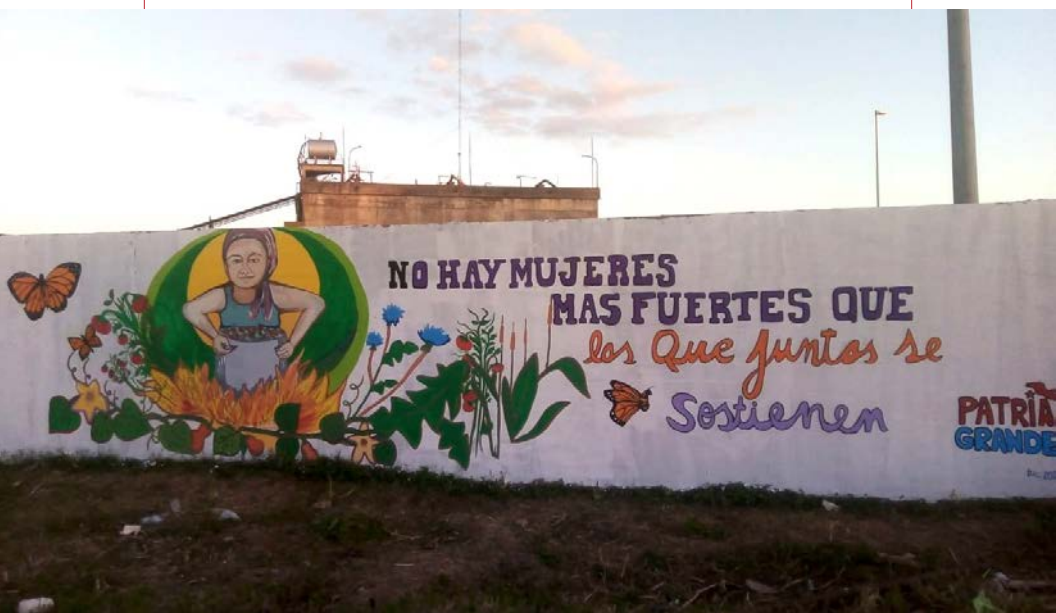
Mara Valdés, There are no women stronger than those who support each other , Buenos Aires Province, 2020.