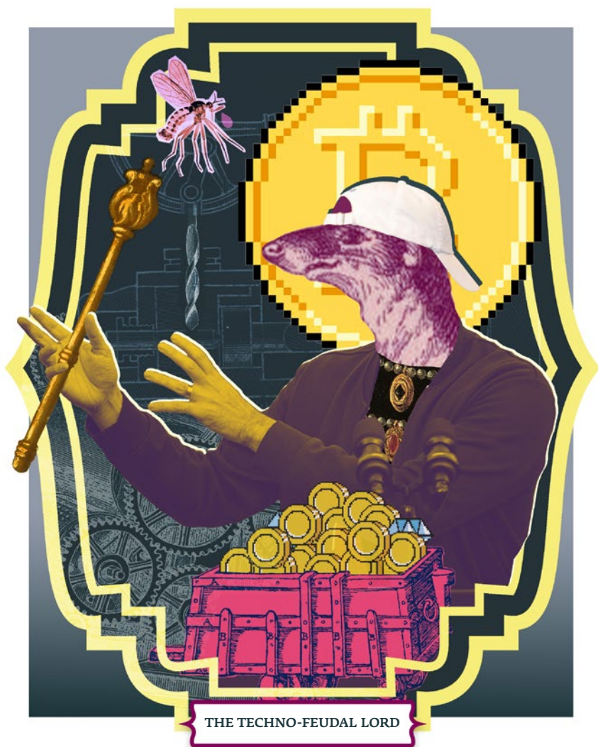
THE TECHNO-FEUDAL LORD