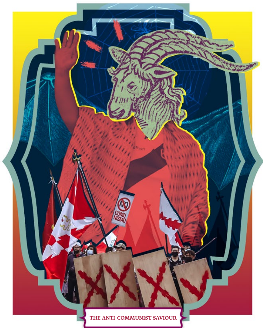
THE ANTI-COMMUNIST SAVIOUR