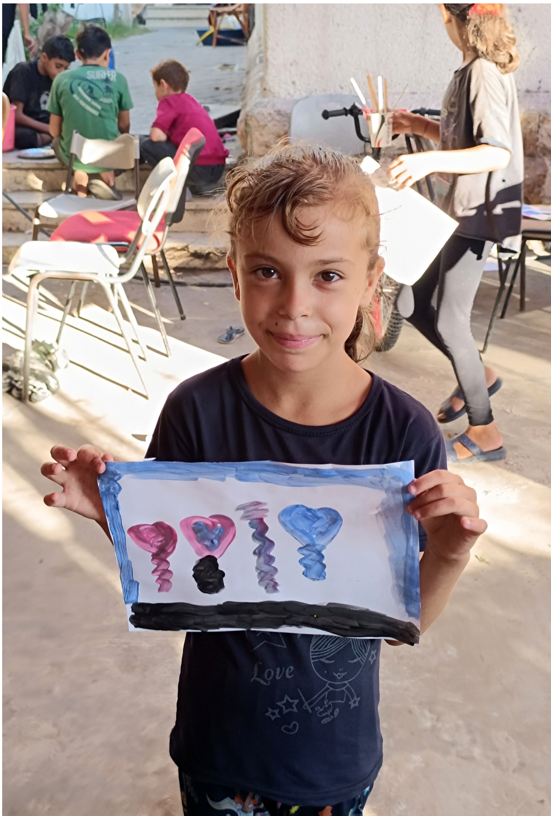
Name unknown (Gaza, Palestine), Untitled , 2024. Evacuated with her family in October 2024.