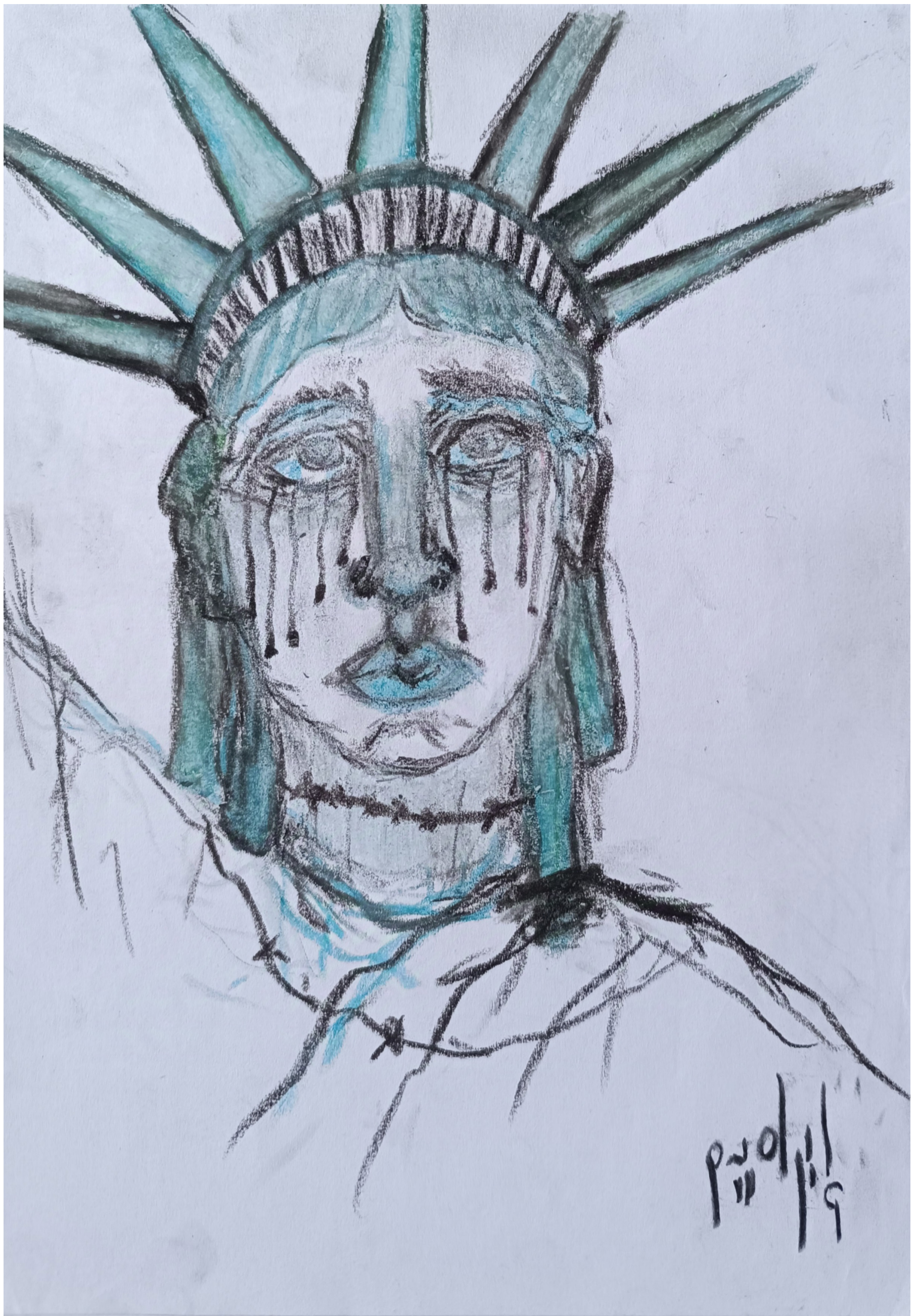
Ibraheem Monhana (Gaza, Palestine), Untitled , 2024.