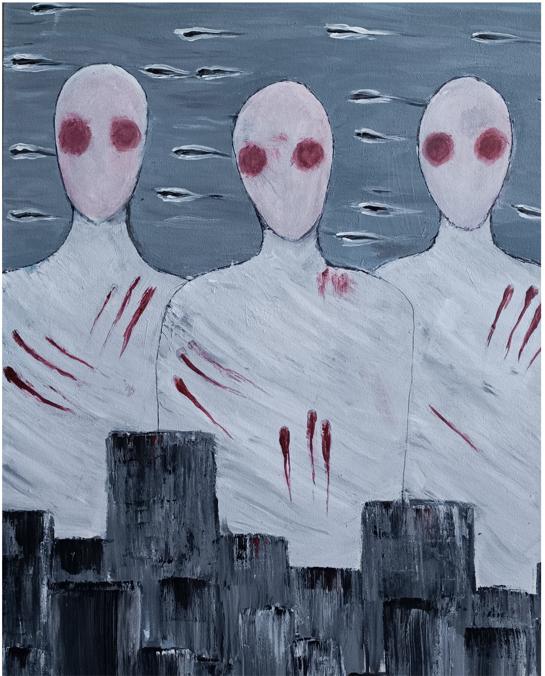
Ibraheem Monhana (Gaza, Palestine), Untitled , 2024.